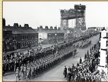
Opening Ceremony of (Tees) Newport Bridge, Middlesbrough

The project will be amongst the first to make use of the recently founded British Steel Collection based at Teesside Archives. The collection, consisting of thousands of business reports, private papers and images directly relating to Teesside's heavy industries, will shed new light on the lives of both the industries' employers and employees.