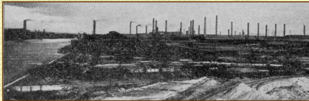
Britannia Steel Works, Middlesbrough

Middlesbrough's steel industry undoubtedly played a crucial economic role in the life of the town and its people. The industry provided work to thousands of the town's inhabitants in both the works themselves and also in the numerous transport, building and retail industries that were reliant on the fortunes of the steel works.