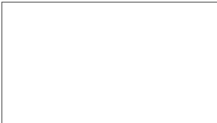
Figure 3. Average days in trade credit (using the Proxy) from 1998 to 2007: UK FTSE case.

In addition, the liquidity problems of UK firms increase because the availability to credit banking and capital markets has reduced with the credit crunch. The results of the survey made by Confederation of British Industry (CBI) to analyze the situation of firms in UK in terms of credit conditions show the availability problem to get external funds. The used sample in 2009 is 113 firms of difference size, small and medium (0-240 employees), large (250-4999 employees) and very large (more than 5000 employees). The results show that eight in ten very large firms reported deterioration in credit availability, and 63% of small and medium-sized enterprises and over half of large businesses have experienced a reduction in credit availability since the beginning of the credit crunch. So, the availability of credit to the corporate sector has worsened over the past quarter, and over the next months a further similar deterioration in the availability of credit is expected. Moreover, the weak accessibility to external funds