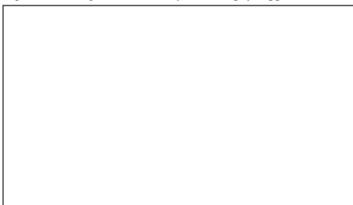
Figure 2. Average number of days used to pay suppliers (Directors’ Report Proxy): UK Plc firms in 2008.

Mean 2006/2007: 42 days Mean 2007/2008: 46 days