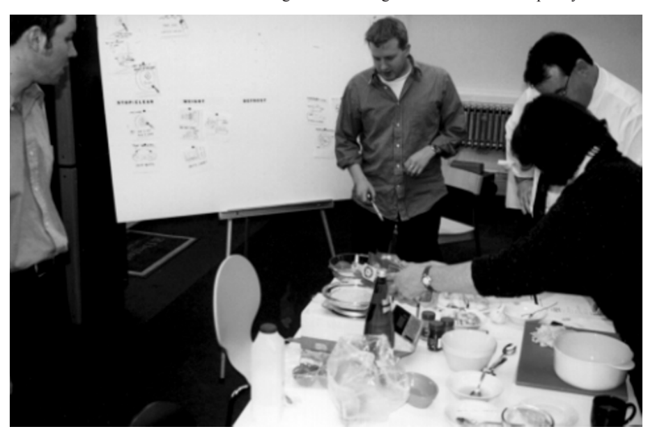
Fig. 5.3. Tab board in use