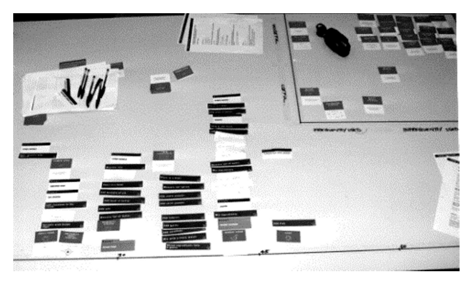
Fig. 5.5. Example of task map and function filter

participants made requests for functions that did not exist on the board. In this situation, the designer and participant would simply draw a new tab that suited their needs. The process of design, build and test could be achieved in a matter of minutes.