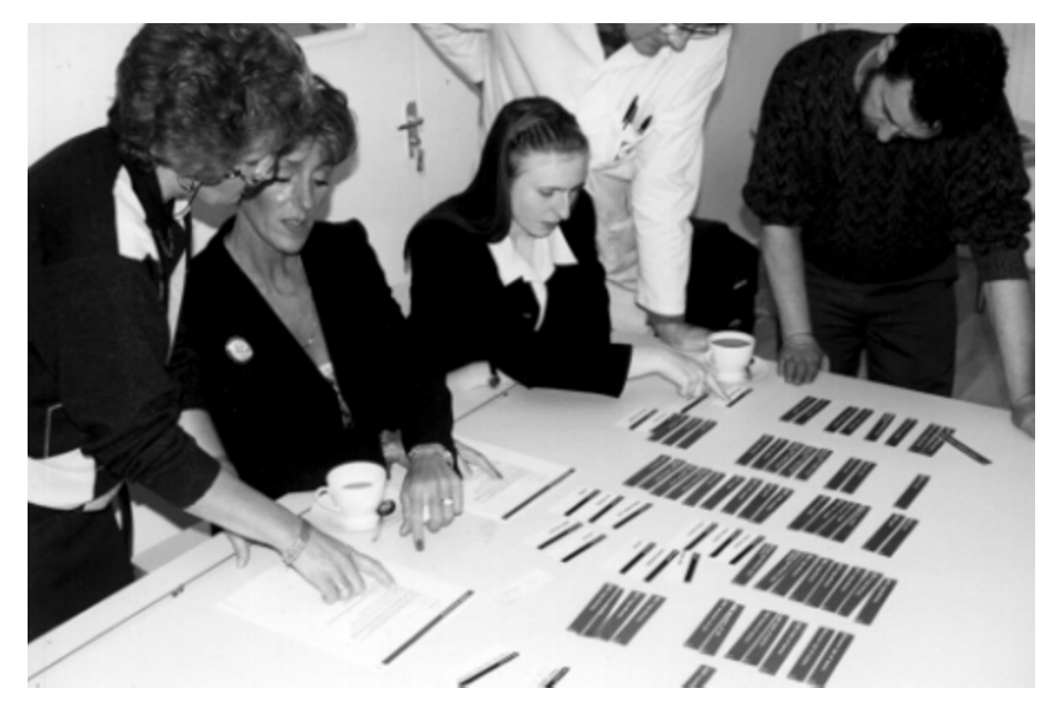
Fig. 5.1. Participants involved in card-sorting exercise

Two card-sorting workshops were first carried out, each with five non-design employees. Figure 5.1 illustrates a card-sorting workshop in action. During the card-sorting workshops, the designers recorded any thoughts or comments on a large flip chart and photographed key events, such as the completed task map. The key outcome from the card-sorting workshops was a user-requirements brief in the form of a large (1.5 m wide and 1.0 m) board. This was used to form a tab board for the next design tool, scenario design, which was based on preferred function cards clustered into cells. Tabs were small, annotated sketches of preferred or suggested function