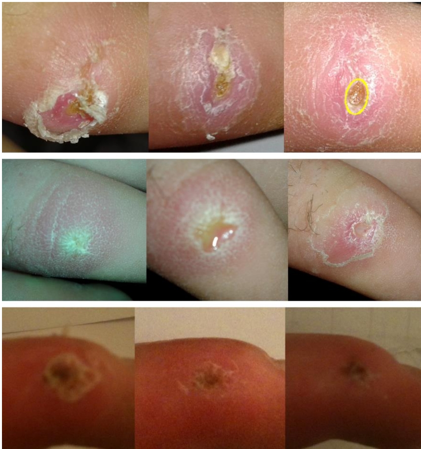
Figure 1. Selected examples of DU/lesion images taken from 3 sequences. Sequences demonstrate the varying quality of images captured by patients (particularly the bottom sequence where there are focus issues), although all were acceptable for further quantitative analysis. Top (L to R): days 1, 24, and 35; Middle (L to R): days 1, 4, and 12; Bottom (L to R): days 2, 7 and 18. Lesions are represented by sequences 4, 5 and 6 in Figure 2 (top to bottom respectively). Top right image includes example of fitted ellipse shape (yellow outline) from software analysis.