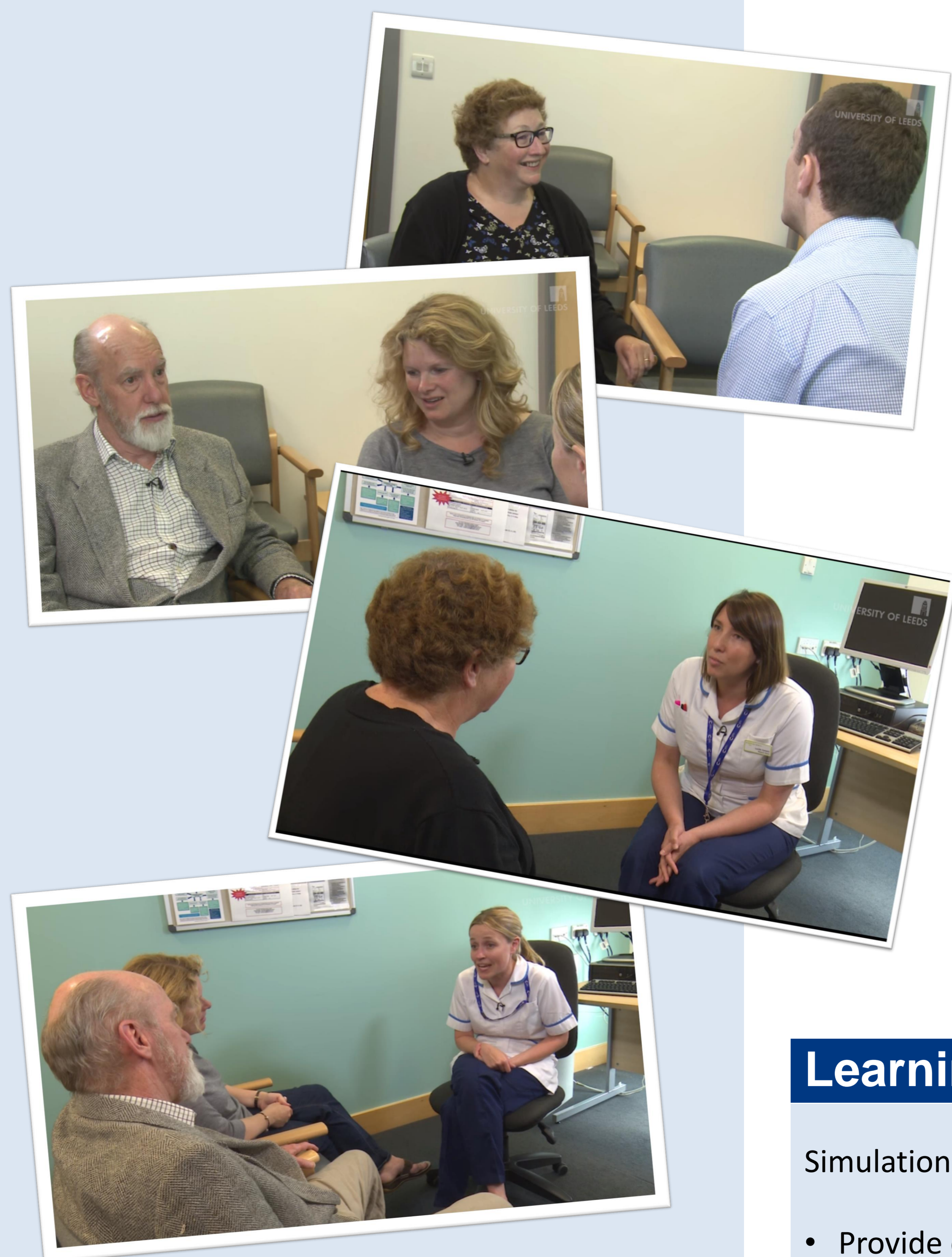
Stills taken from the SABRTOOTH films

Both of these studies include a surgical and a non-surgical arm. Previously, similar studies have faced recruitment challenges.