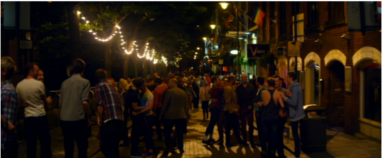
Figure 8 - Image: Cucumber, Channel 4 2015

the railings opposite, marking the space and providing a clear visual demonstration of who the space is intended to be for, without intimidating or limiting the clientele.