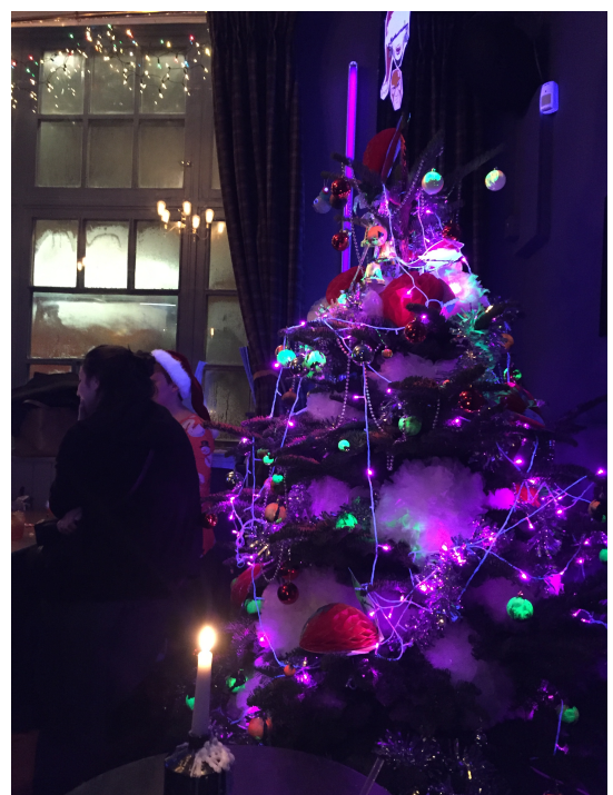
Figure 4 - Image: Own Work

adapting nature, there are still aesthetic conventions that can be observed around particular styles, pieces and events. Queer aesthetics, whilst commonly taking from and parodying fashion, do not bow to the same fashion trends. Queer aesthetics are best discussed in terms of scenester and patron dress, with the dress choices of the observer more closely aligning with mainstream and heteronormative fashion as a result of their limited interaction with queer space and expression. In these subgroups, trends take on new meaning as common conventions that have occurred in multiple personalities outfit choices and in more than one space. For example, around Christmastime 2015 at The Glory in Haggerston, the Christmas tree in the bar area was decorated with neon and ultraviolet reactive colours and decorations, as well as severed doll heads. To take advantage of this, there were multiple cases of people dressing in attire that would provide the same effect in the UV light, as well as those who