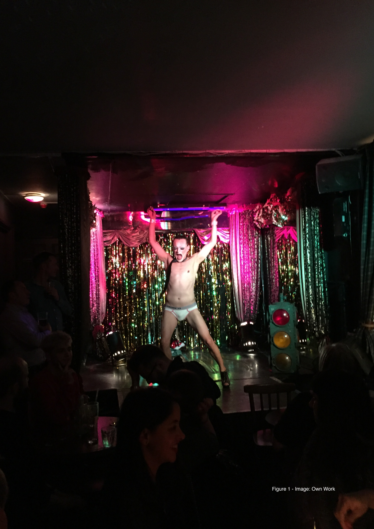
Figure 1 - Image: Own Work