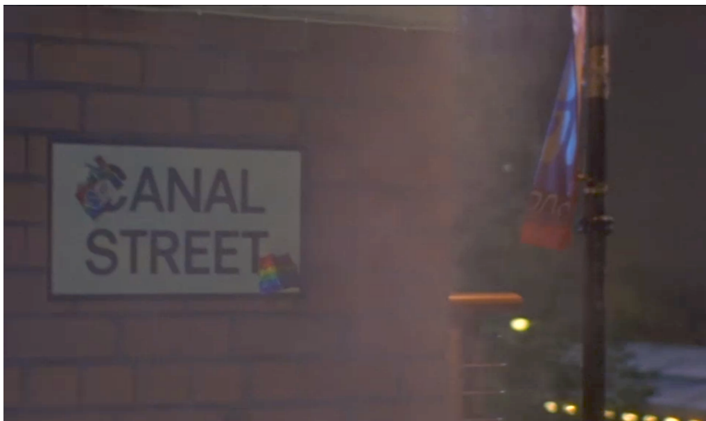
Figure 6 - Image: Queer As Folk, Channel 4

The tongue in cheek attitude to sexuality and lifestyle can be seen in the characterisation of the street, with the overt use of rainbow flags, the traditional marker of gay space and gay friendly venues, and the "creative vandalism that continually erases the C and S from Canal Street" (Skeggs, Moran, Tyrer, & Binnie, 2004) in a self deprecating yet humorous marking of the space as predominantly gay. This irreverence towards sexuality and gender in day to day socialising manifests in the aesthetic conventions of Canal Street, exemplified, as previously mentioned, by the use of drag as a tool to reflect surroundings and culture in gay and queer space.