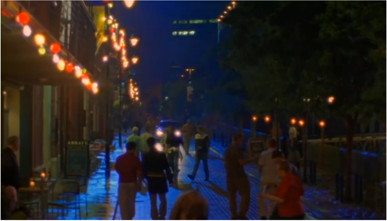
Figure 7 - Image: Queer As Folk, Channel 4 1999