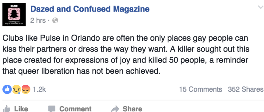
Figure 9

– straight or gay – who thought that queer liberation was already achieved this is a painful reminder it has not been” and that the media had underplayed the relevance of their queerness, a common feeling held in the LGBT community, adding “The 50 queers slaughtered were killed because they were queer and seeing mainstream news outlets, uncomfortable with this reality, try to deny or elide this reality makes me despair, then angry” (Faye, 2016).