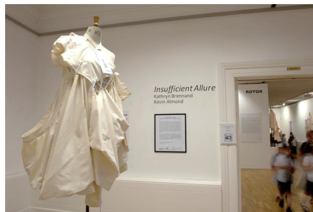
Fig 6. Insufficient Allure (2012) exhibition by Kevin Almond and Kathryn Brennand.

Other groups to draw on the ROTOЯ experience have included local performance dance groups, which have incorporated exhibitions into their performances. ROTOЯ also collaborated with Kirklees Library to disseminate exhibition content, leading to new book purchases and increased lending. Kirklees Library assistants reported a 50% rise in borrowing for the books selected for the ROTOЯ reading group, including some that were rarely borrowed previously, noting, “[ROTOЯ] has been very positive [...] It brings the University into a different space.”