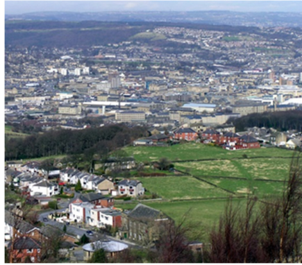
Fig. 1. A view of Huddersfield Town from Castle Hill.

Surrounded by countryside and with a population of approximately 146,000 and rising, Huddersfield in West Yorkshire, England, is the 11th biggest town in the country. With its rich vista of historical architecture, much of which dates back to the early 19th century, it boasts the third highest number of listed buildings in the country after Westminster and Bristol. In 1845 Friedrich Engels described Huddersfield as “the handsomest by far of all the factory towns in Yorkshire and Lancashire by reason of its situation and modern architecture”, and more recently the Guardian newspaper described it as “the Athens of the north” (The Guardian, 2004).