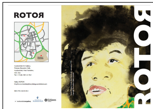
Fig. 3. ROTORЯ part 1 (2012) brochure, cover image: Patrick Procktor, Jimi Hendrix III (detail), 1973.

In 2011 the University of Huddersfield signed a memorandum of understanding (MOU) with Huddersfield Art Gallery, signalling the start of a formal partnership between the two organisations, and instigating an ardent period of collaborative working through a public engagement project entitled "ROTORЯ: transdisciplinary dialogue and debate". ROTORЯ acts as a platform for disseminating and communicating practice-based research through exhibitions, and supporting events and activities, including tours, public talks, reading groups, film screenings, workshops and some outreach activity. The programme showcases a community of artists, designers and curators – all current staff at the University – whose ideas and connective practices migrate and span art and design production. The ROTORЯ programme of exhibitions and events has been a cornerstone of the University of Huddersfield's efforts to introduce new audiences to contemporary art and design, as encouraged by successive Arts Council policies for enhancing public engagement. It also aims to help break down the 'ivory tower' view of universities by taking research outside of the University and into the public realm, making it visible and compelling, and enabling a sense of understanding, community ownership and civic pride in relation to the University and its work.