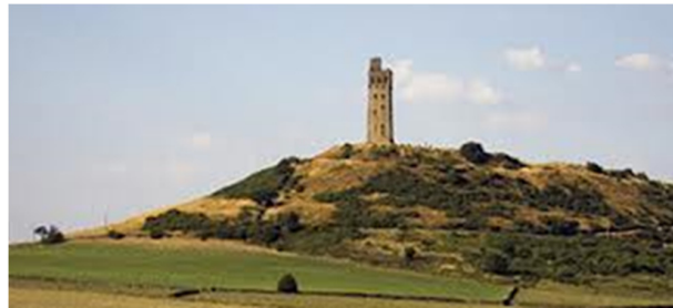
Fig. 2. Looking out towards Castle Hill from the town.

Despite the idyllic image depicted here, Huddersfield suffers from its share of problems. Relative to other UK towns of a similar size it suffers from high levels of deprivation, including significant income deprivation, high levels of health and mental health problems and is lower than average for education and skills. The wider borough of Kirklees is one of the 50 most disadvantaged local authorities in England (of approx. 433 boroughs) in terms of income and employment.