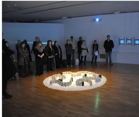
Fig 4. Opening night of Trace. Exhibition.