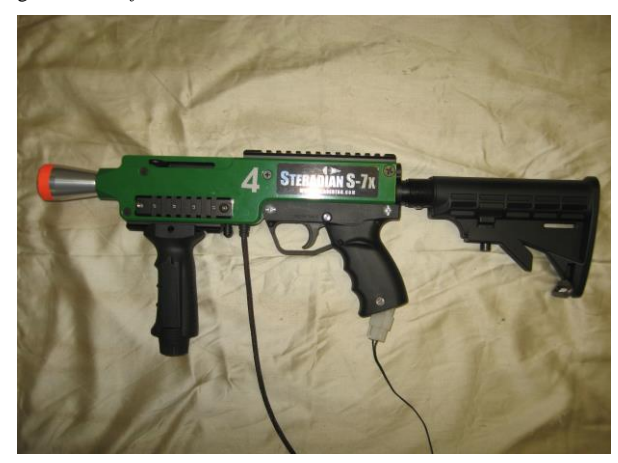
Figure 1. Modified Steradian SX-7 Laser Gun

Questionnaires . The NASA-TLX (Hart & Staveland, 1988) was used to subjectively assess workload.