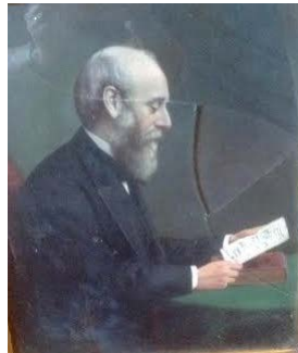
Dr Samuel Smiles MD