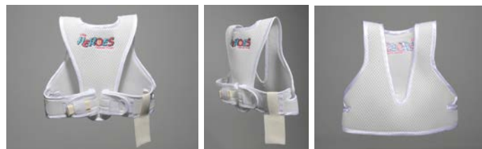
Figure 2 - Final Prototype

initial trials regarding comfort of other products available on the market which informed the design of what has become known as the “Wiggle Bag”. Initially there was some reservation regarding wrapping the central venous line, around the body, yet initial trials showed this to be the most comfortable position for wear. The size of the pocket was initially thought to be important to provide impact protection, but the technical requirements showed this to be lower down on the priority scale. This changed the design from a bulky pocket, to a disposable belt bag that was relatively flexible (Figure 2).