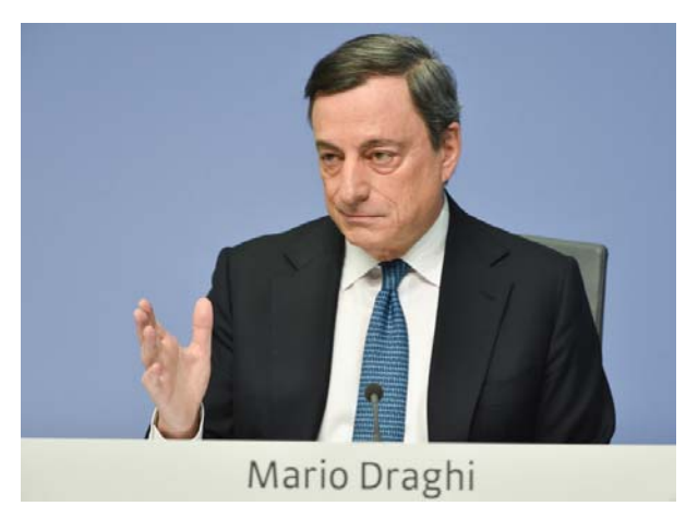
Trigger happy president?

Draghi also announced another round of quantitative easing – the introduction of new money into the economy. It is the eleventh attempt to reignite money supply growth since he took the helm and will increase the current injection of €60 billion a month to €80 billion each month.