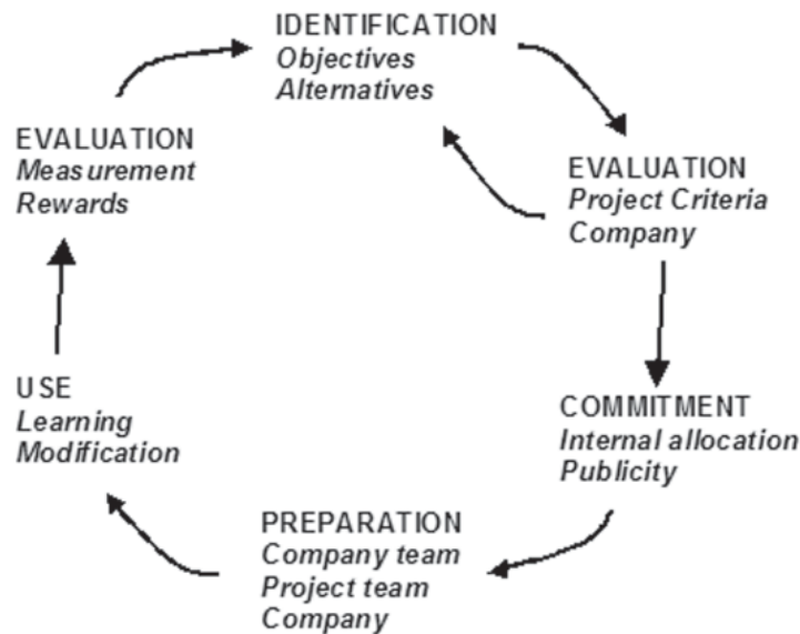
Figure 1: Innovation adoption process (Slaughter 2000).

A general innovation adoption process, as represented in Figure 1, consists of a cycle of implementation stages and activities. The implementation cycle consist of six stages: identification, evaluation, commitment, detailed preparation, actual use, and post-use evaluation (Slaughter 2000). Usually implementation processes may proceed through each of the stages. However, in certain cases the evaluation stage may reveal new criteria which need to be reconsidered in the identification stage and these two stages may cycle through a few repetitions.