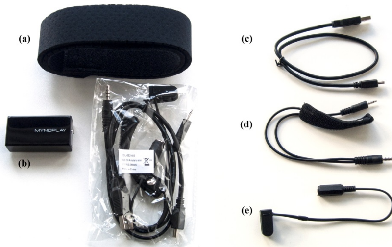
Fig. 2. The components of the MyndPlay BrainBandXL EEG Headset: (a) the headband on which the rest of the components are attached, (b) the unit that transmits via Bluetooth the EEG data to the computer, (c) the USB cable for charging the unit, (d) the two dry sensors attached to a soft material similar to the one used for the headband, and (e) the ear clip with the grounding electrode for the ear lobe.

frequency, which corresponds to the delta band, is rejected, in order to suppress low pass noise, electrooculographic (EOG) and electrocardiographic (ECG) artifacts (artifacts deriving from the movements of the eyes and the cardiac muscle respectively). Also the 40Hz and above frequencies are rejected, in order to suppress electromyographic (EMG) artifacts from the body muscle movements, high pass and line noise from electrical devices in the proximity of the performer/s and the participating spectator/s. The processing continues with static and moving average filters in order to compute and output at any given time the power of each selected frequency band and in this way to identify the predominant one. The processed EEG data of each participant are being recorded, not only as documentation of the performer/s' and the participating spectator/s' brain-activity, but also in order to be analysed off line after the performance and compare them with related studies in a lab environment.