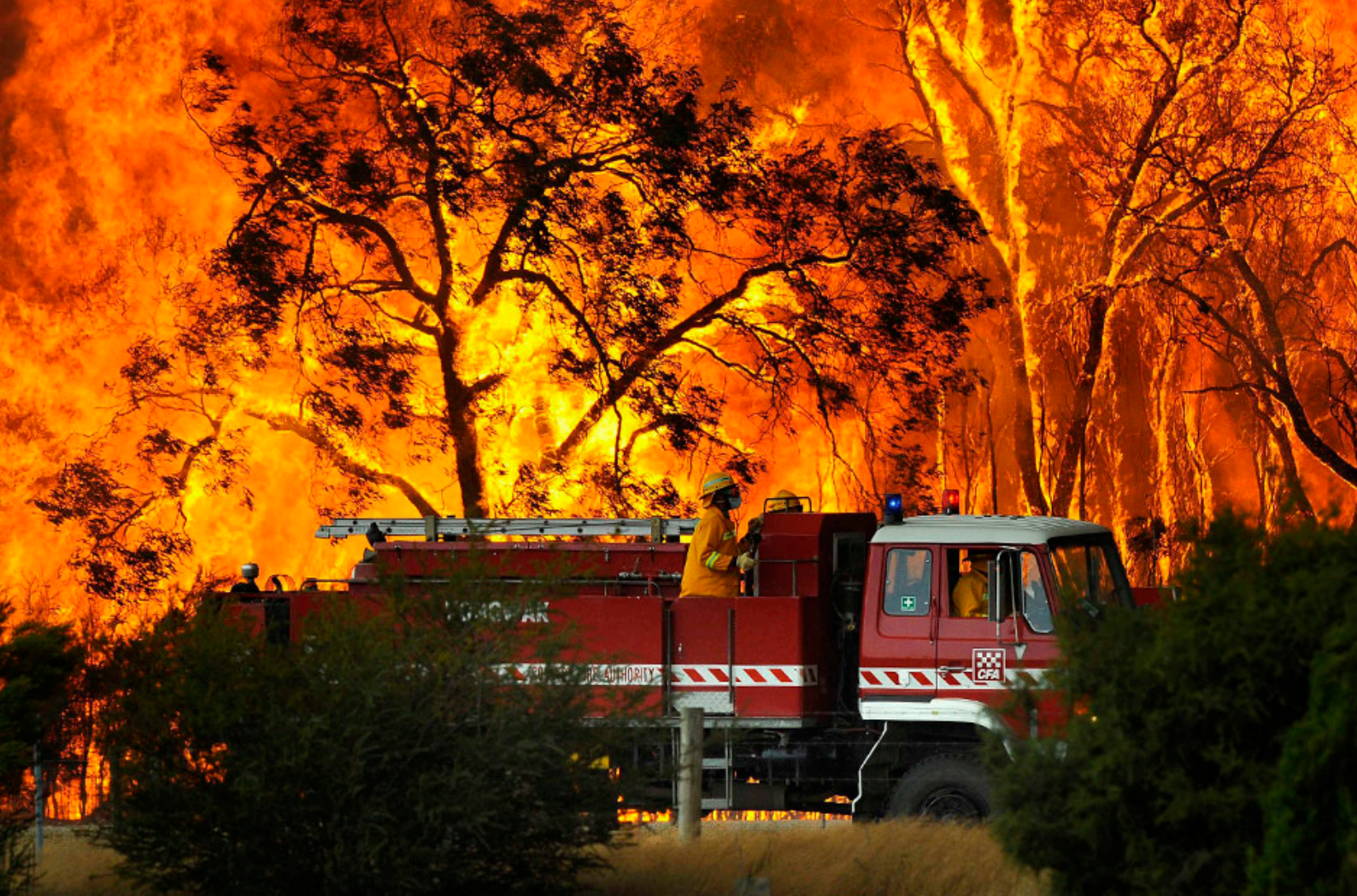
ABOVE: Bushfires in Victoria, Australia