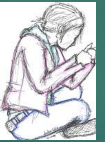
Art work credit: Hero-in-shame, Deviantart.com