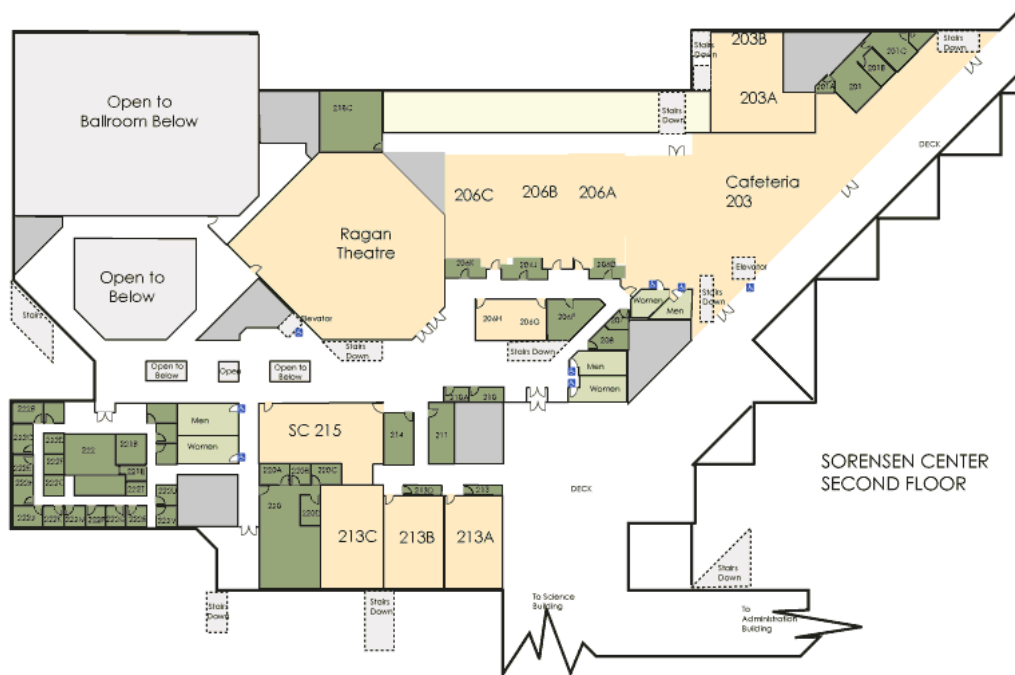
SORESEN CENTER SECOND FLOOR