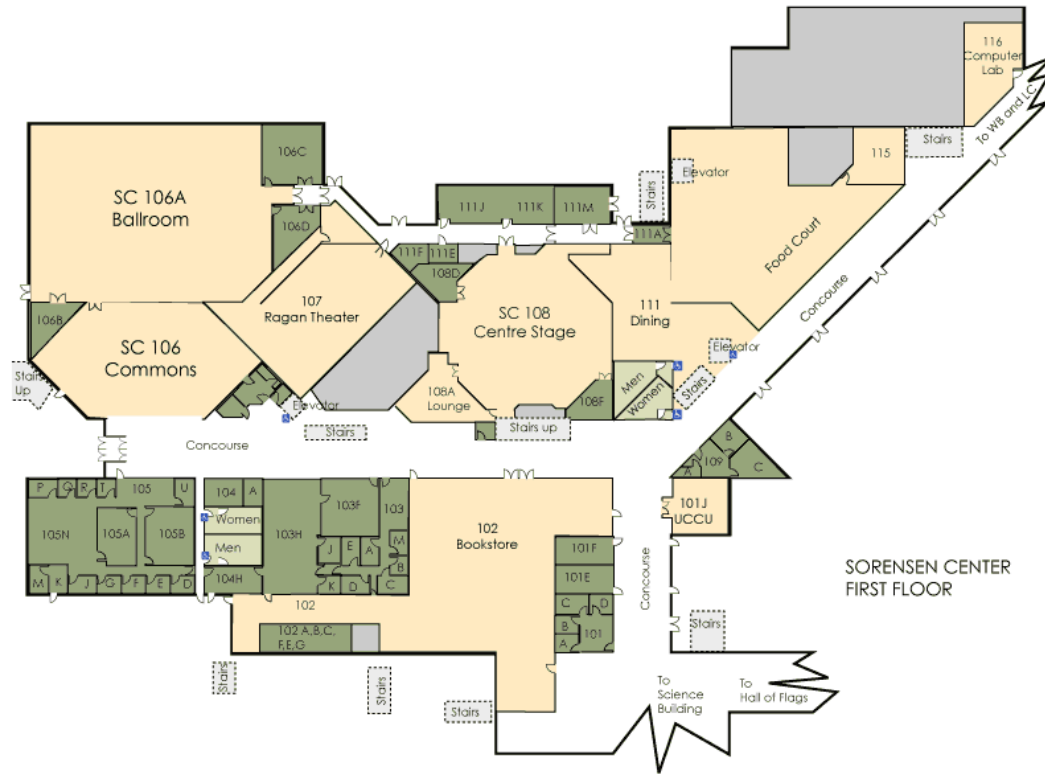
SORESEN CENTER FIRST FLOOR