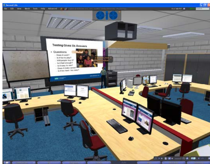
Figure 1. A snapshot of the virtual classroom

The lecturer also spent half an hour helping them familiarise with the basic controls before starting the lecture session. During the lecture, students logged in SL and teleport to the virtual lab B213 to attend the session, while physically they were in the real lab B213. Student responded to a questionnaire after the session concerning their attitudes toward using Second Life as a learning tool.