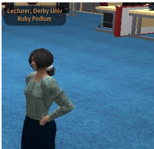
Figure 3. A tutor avatar with a tag above her head

If the voice feature is not used, the tutor can't talk louder to get the audience's attention by typing texts. Robbins [13] suggests that the lecturer can use all capital letters in text chat to lead a discussion so that students can easily pick out her text out among the lines of chatter, but this verbal marker is easily snatched away if one of the students decides to use capitals too. Since the voice viewer of SL was released in 2007, educators can utilise this feature to regain the verbal marker of the teacher role, especially in the regular situation that the teacher is the only one who has a microphone in the virtual and real classroom. Other in-world communication modes like IM and group IM can be used to establish or enhance the verbal marker of the teacher.