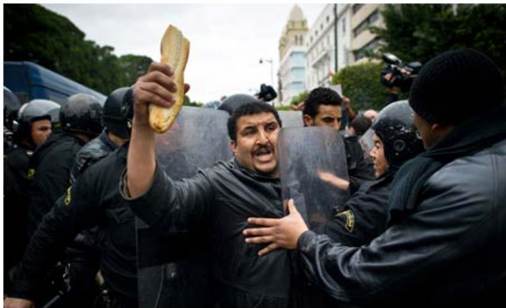
A Tunisian protester holding bread confronts riot policemen during a demonstration in Tunis on January 18, 2011.

Seeking simple explanations for the Arab spring uprisings that have swept through Tunisia, Egypt and now Libya, is clearly foolish amidst entangled issues of social injustice, poverty, unemployment and water stress . But asking "why precisely now?" is less daft, and a provocative new study proposes an answer: soaring food prices .