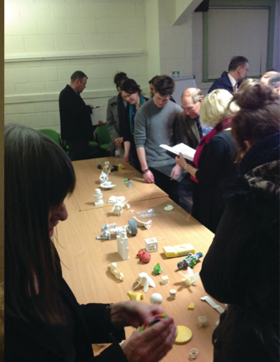
Delegates interacting with 3D Print objects