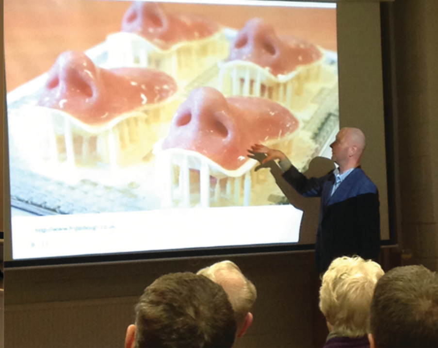
3D Printed medical devices design and manufacture by Frippdesign