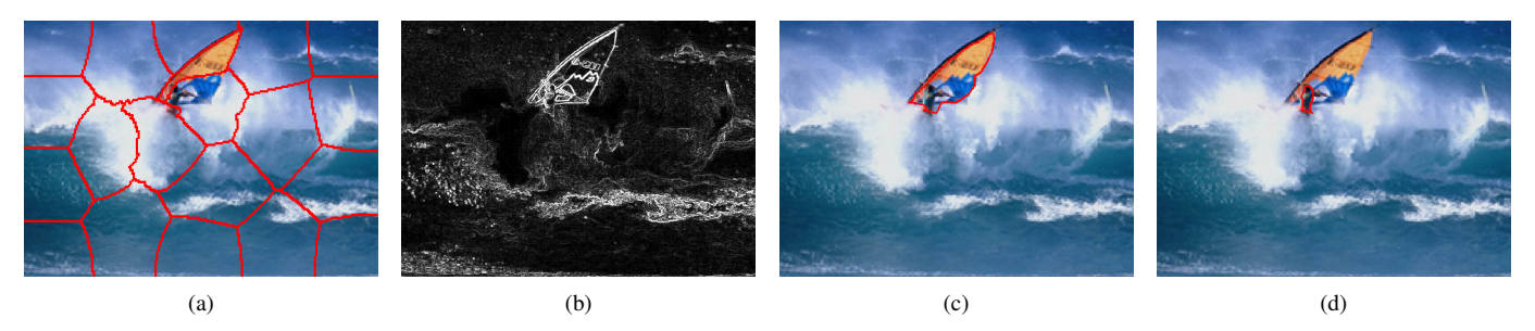
Fig. 2. Feature extraction with (a) N-cut method; (b) edge map; (c) first-layer multi-feature active contour; (d) second-layer multi-feature active contour.