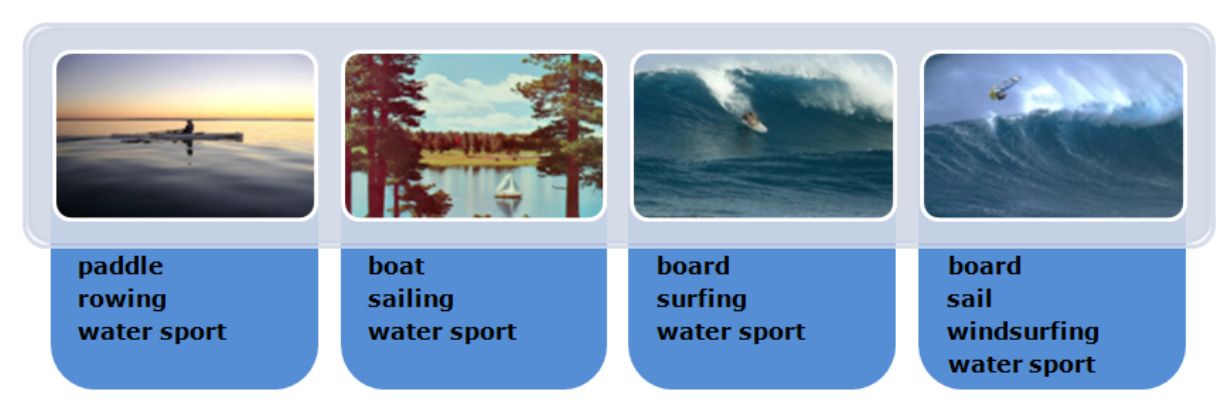
Fig. 7. Examples of semantically annotated images with our automatic system.

the images, with a computational time in the range of few ms (Figs. 7 (a)-(d)).