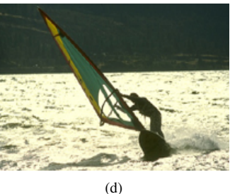
Fig. 4. Examples of four semantic classes of our dataset: (a) rowing; (b) sailing; (c) surfing; (d) windsurfing.