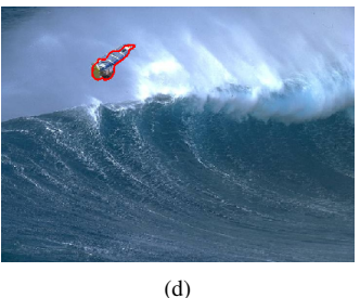
Fig. 5. Examples of automatically segmented images from the dataset. Best viewed in color.

Some samples of automatically annotated images with our approach are presented in Fig. 7. More results are discussed in Section II.