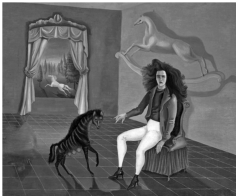
Figure 4.5 Leonora Carrington, Self-Portrait: Inn of the Dawn Horse, 1937. Oil on canvas, 25 5/8 x 32 in. Metropolitan Museum of Art, New York. The Pierre and Maria-Gaetana Matisse Collection, 2002 (2002.456.1)

This motif of facelessness is reflected in Tanning's Chasm , when the vain adult female character Nadine falls prey to the lion who tears off her face: '[the lion] bent down, raised his paw and began to tear at the face [...] the body of Nadine lay as it had fallen [...] but there was no longer a face...' 37 Both conjure violent spectacles which cut into the core of reality, creating a sur-reality out of textual shock and rupture. They echo chapters from Bataille's Histoire de l'Oeil , 'Lewd Animals' and 'Granero's eye', where Simone's 'violent desire' 38 prompts her to demand the testicles of the bull, who will mangle the 'Prince Charming' 39 matador, Granero, by tearing out one of his eyes. In the first 'Manifesto of Surrealism', Breton captures this slicing action with the phrase: '[t]here is a man cut in two by the window' 40 . Following the inherent violence of Max Ernst's cut-and-paste collages found in