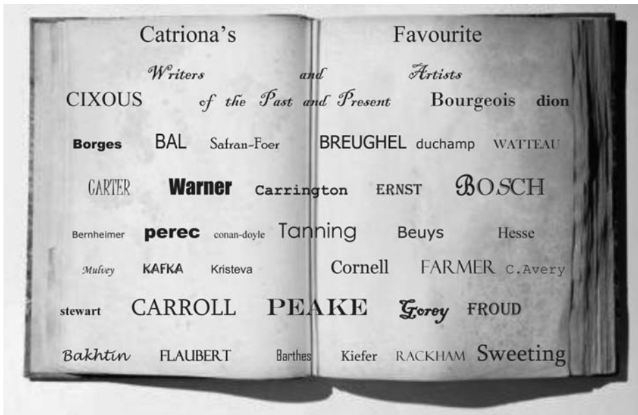
Based on 'Max Ernst's Favorite Poets and Painters of the Past' in View Magazine: Special Max Ernst Edition , Charles Henri Ford ed. Series II, No.1 (April 1942): 14-15.