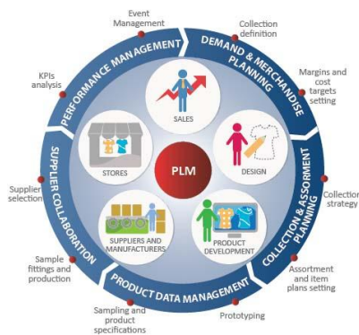
Figure 1. CONCEPTUAL PLM SYSTEM

It is envisioned that the future direction for the project will reach out into business communities and provide conduits to SME (small and medium enterprises) to create a community of learners, educators and industry communicating, learning and working together through open and flexible use of digital technologies and e-learning technologies.