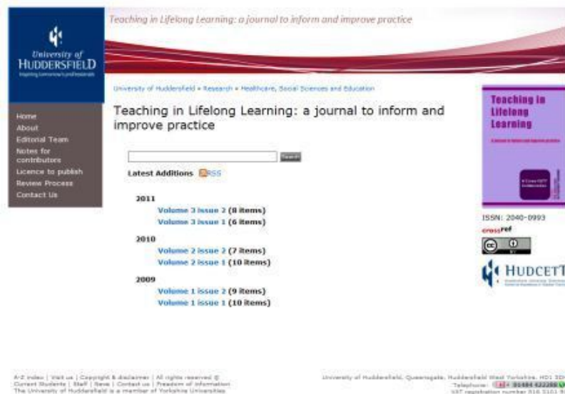
Figure 1., Teaching in lifelong learning landing page

The creation of the journal landing pages and the volume/issue pages is fully automated. The articles are uploaded into the Repository in the normal way, with the first article of a new issue automatically creating a new entry on the landing pages (Figure 1) and a new issue page by referencing the ISSN, year, volume, issue and page numbers in the articles. Each subsequent article deposited in the issue will therefore be listed on the journal pages. The efficient workflow means that an entire issue can be uploaded in around 30 minutes. The articles themselves maintain the standard Repository branding, but each one also links back to the journal’s landing pages on the platform. This simplifies the process and aids discovery, e.g. the article only has one instance in the Repository and can be discovered through the Repository, journal landing pages, via Google (Scholar), and in due course, the DOAJ. Inclusion in DOAJ will mean that the title will be retrieved from web scale discovery systems such as Summon, Primo etc.