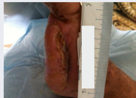
Figure 4: Wound bed is 100% granulated and there is no current need for antimicrobials, although their prophylactic use has been considered