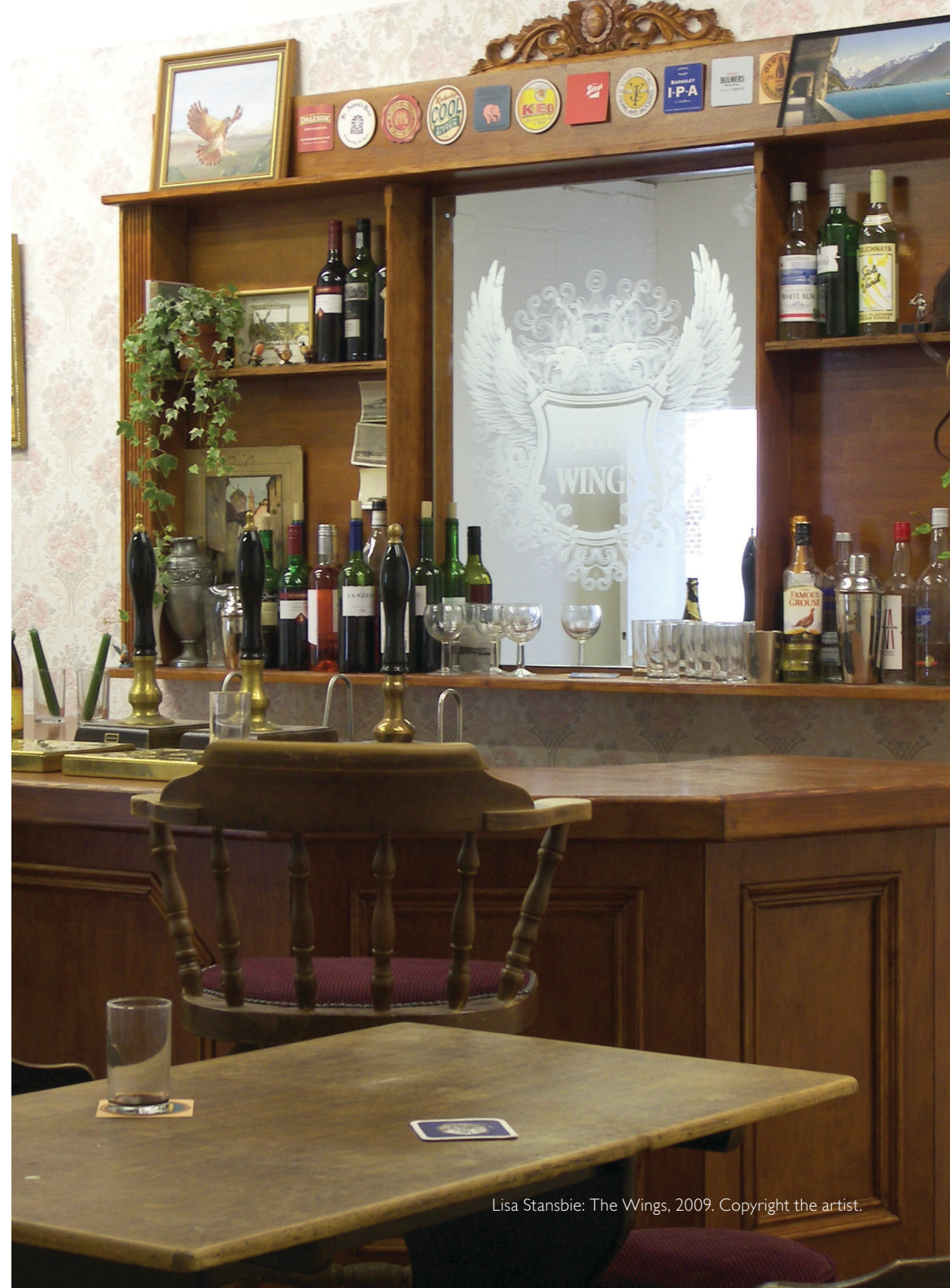
Lisa Stansbie: The Wings, 2009. Copyright the artist.

Flight is a collection of works that has its roots within the archive. The pieces are connected to each other through the act of flight. These seemingly arbitrary pieces involve wings, aeroplanes and birds and their genealogy can be traced to the archival starting point. The fictional narratives encourage notions of flight in one's mind, instilling a sense of leaving, loss, escape and journeys.