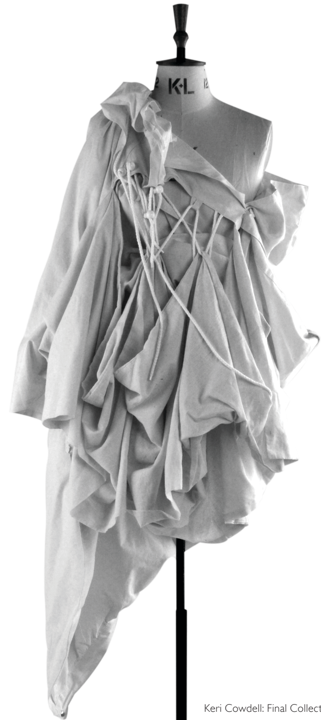
Keri Cowdell: Final Collection Toile, 2009

Creative pattern cutting is a craft-based skill that extends the boundaries of fashion design and traditional tailoring to innovate new spheres of body shape. Insufficient Allure features a series of clothing compositions or toiles and a series of corresponding photographs which show complex pattern cuts and loose layers of fabric constructed imaginatively and then placed onto the design to create accentuated forms. Insufficient Allure locates the role of the pattern cutter as a highly skilled craftsperson within the fashion industry, one which is as significant and creative as the elevated position of the fashion designer. The exhibition provides a critical review of the pattern cutter's integral position in context to creative design.