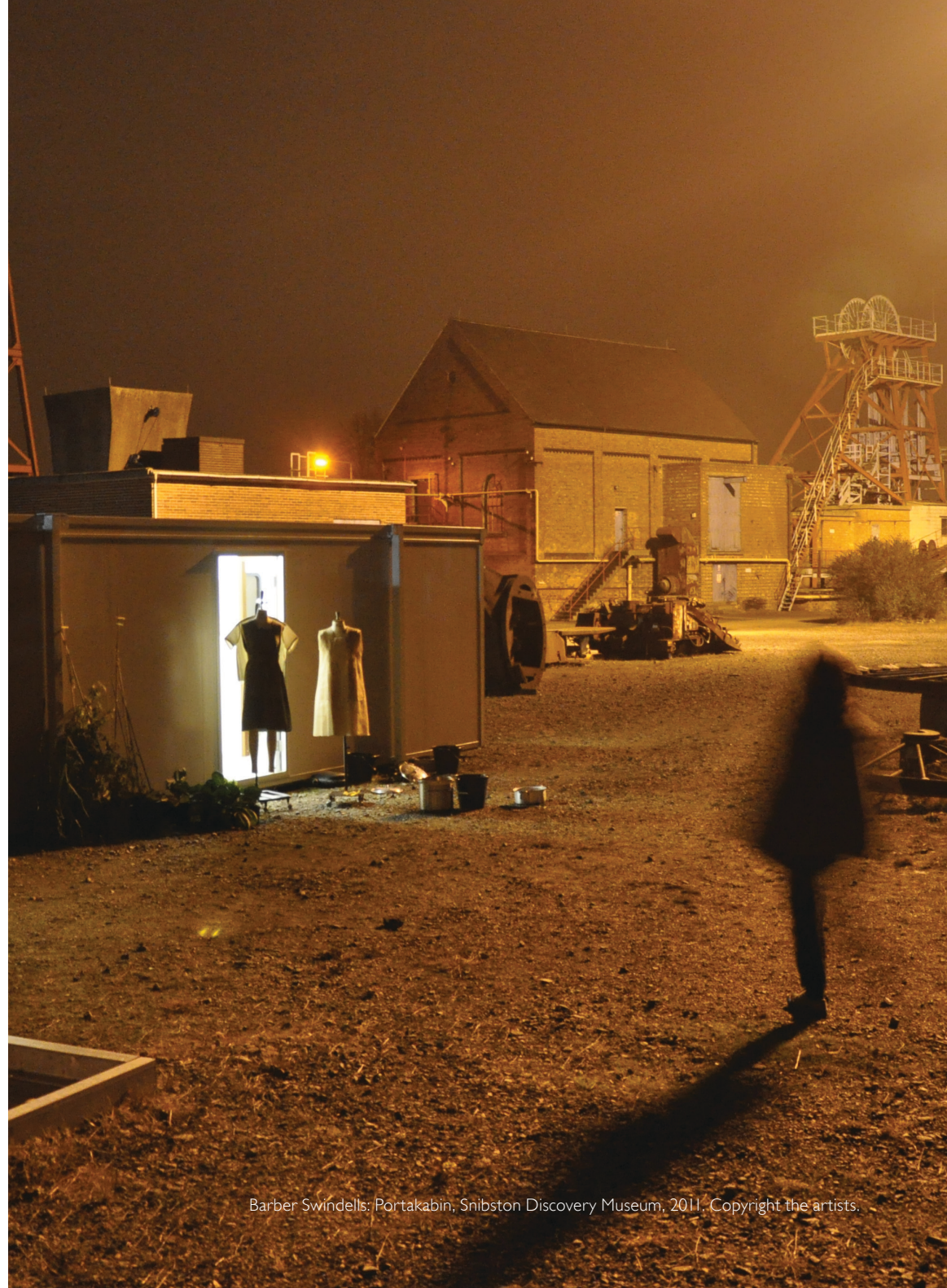
Barber Swindells; Portakabin, Snibston Discovery Museum, 2011. Copyright the artists.

Working across art and craft disciplines Barber Swindells have no restrictions on media, where the relationship between site, community, production and interpretation is often conflated into one composite form. Clothes, fashion designs, artist's drawings, paintings, inflatable sculptures, video and photography explore this latency as a simultaneous interface between artist and audience.