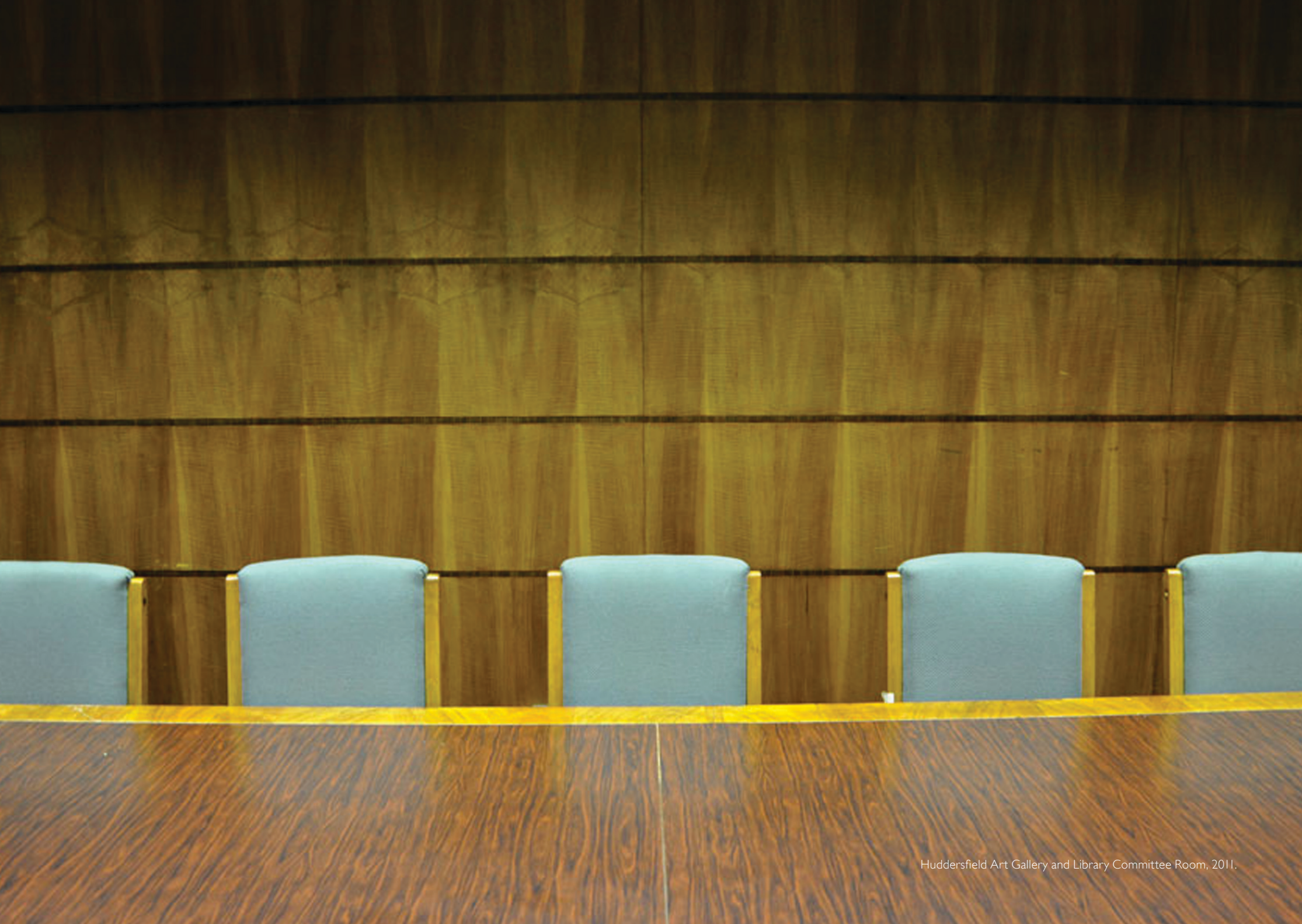
Huddersfield Art Gallery and Library Committee Room, 2011.