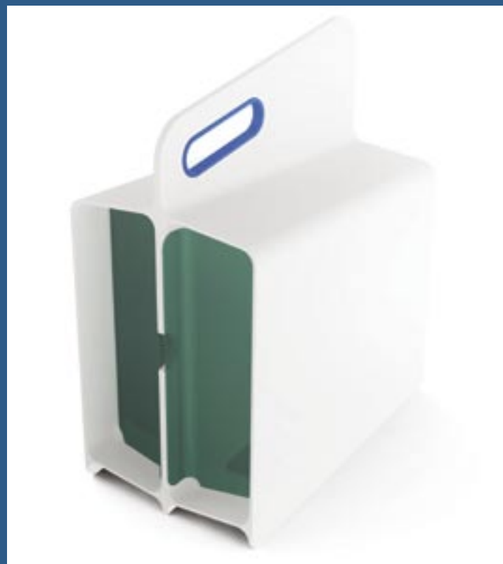
To design a 21st century nursing bag that will improve productivity and reduce transmission of infections

Theone Wilson explains how something as small as a bag could make a big difference in the NHS