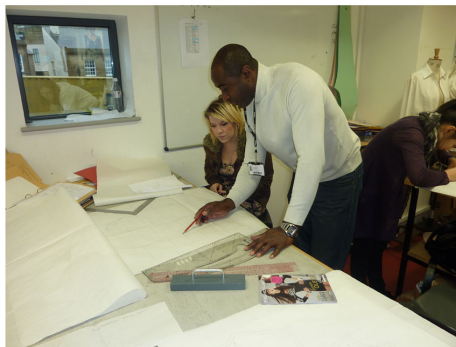
Tailoring class at University of Huddersfield