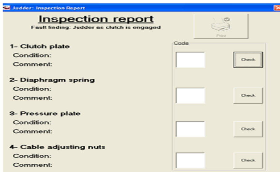
Inspection report or fault finding Report