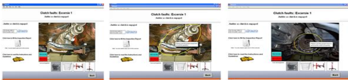
Remove the gearbox with proper tools and dismantle the clutch components