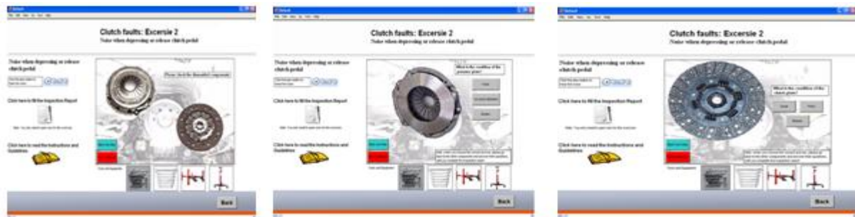
Figure 4 is an example of the quiz for Chapter (Automotive Clutch). The quiz scores and assessment results are reported to provide students with recommendations on what materials should be reviewed for deeper understanding. Figure 5 shows a typical assessment report.

Check the condition of the dismantled components (Pressure plate and clutch plate) and replace