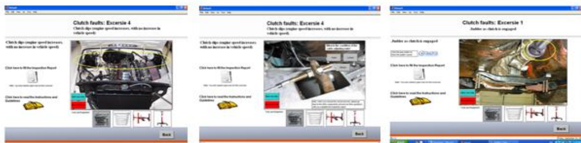
Chuck the condition of the clutch cable adjusting nuts and remove the propeller shaft

Figure 2 and 3 shows typical screen shots of the tutoring software (e.g. video clips, drawings, 3D models, images, photos and drawing) to cover mechanical engineering course (Automotive Clutch).