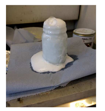
Figure 2: A paper towel used to facilitate clean up.

Tips for a successful experiment – The various chemicals and solutions used can be pre-weighed prior to being provided to the participants. The pre-weighing is especially helpful when there are a large number of participants and the availability of balances is limited. The Aerolite 306 may agglomerate if added too quickly to the water, if this is the case the clumps should be broken up with a spatula/glass rod to allow for a homogeneous solution of urea-formaldehyde to be prepared. Before the foam begins to react and harden the magnetic stirrer used to mix the reactants can be extracted quickly by use of a magnetic retriever. The foam reaction vessel should be placed on top of some paper towels, to facilitate a simple clean up, in cases where the foam reaction escapes the reaction vessel (figure 2).