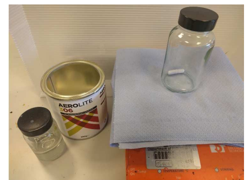
Figure 1: Equipment and materials required for the preparation of UF foam.

Standard laboratory glassware and apparatus are required for running the experiment: glass or plastic bottle as reaction vessel; magnetic stirrer bar and magnetic hot plate; solution of phosphoric acid and urea-formaldehyde (Aerolite 306); and, a surfactant (figure 1). The various components can be pre-weighed and stored prior to use by the teacher or technician.