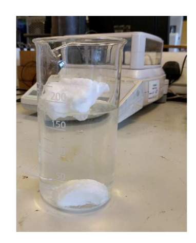
Figure 3: Comparing the density of foam prepared with sodium bicarbonate (top) against material prepared without sodium bicarbonate (bottom) by placing in a beaker of water.

Developing Polymer Knowledge in Secondary Teachers and Students