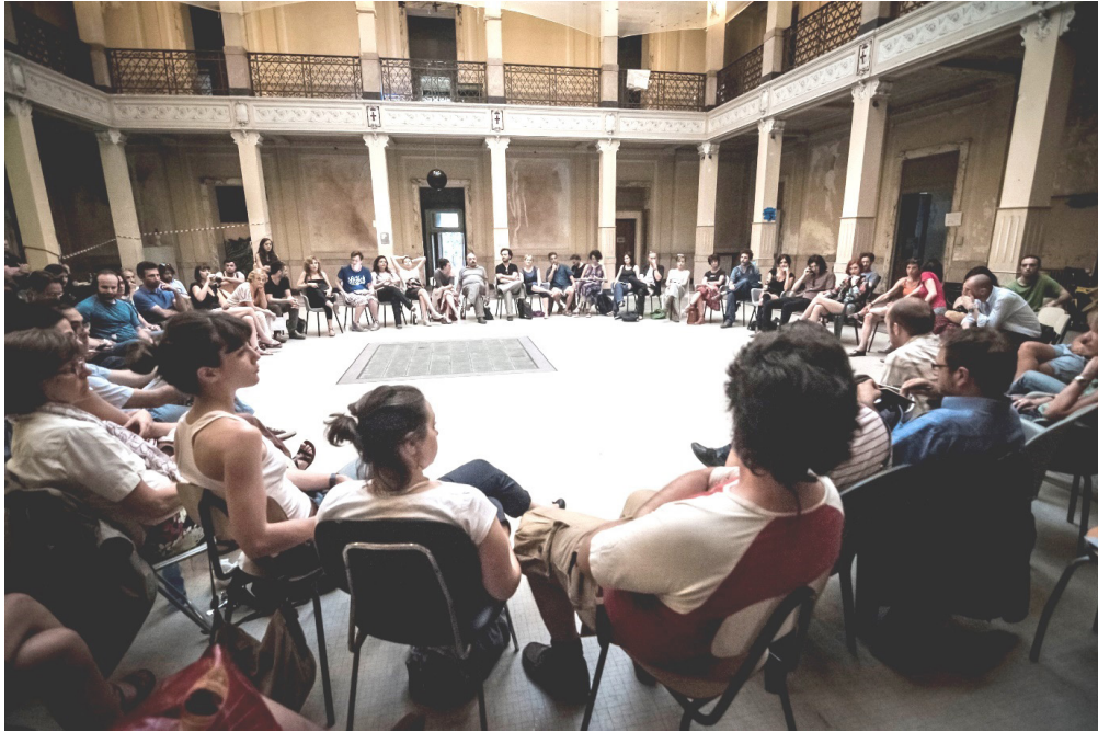
Figure 1: The Macao open assembly takes place every Tuesday night in the central space of the former Slaughterhouse Exchange Building.