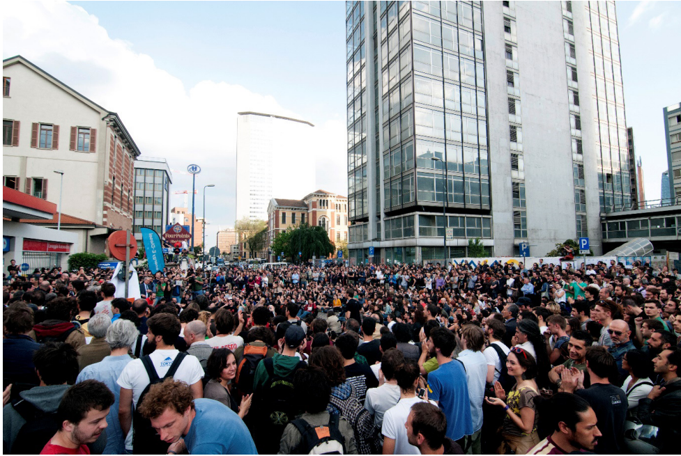
Figure 2: „Piazza Macao“: Public assembly in front of the Galfa Tower, Milan, 5 May 2012.