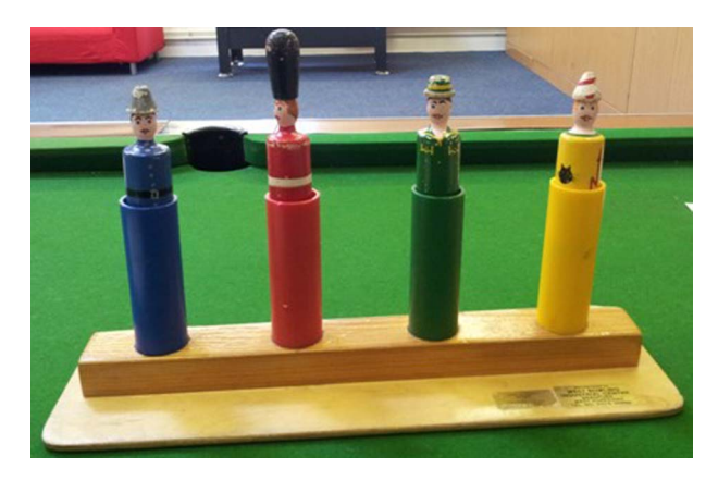
Figure 2 A toy from Leeds Mencap.

Although there are clear parallels in their bids to communicate mental health, and in this case learning disability, the concrete connections between historical endeavour and current practice are not always immediately obvious. Some of this is about the realities of the day job, but equally an agreement on a clear rationale for working together can be an early stumbling block. What these initial thoughts on the process of co-producing outputs have emphasised is the common ground between historians, practitioners and services users and the things we can learn from each other. An understanding of the history of the post-1959 world was important, but on its own it was not enough to draw project partners in. While there may be other pathways to impact for historians of mental health and learning disability, and other ways to communicate the findings of their academic research, working with current stakeholders seems to offer the best and most logical opportunities. Again, most, if not all historians know this already-but in doing so, there are