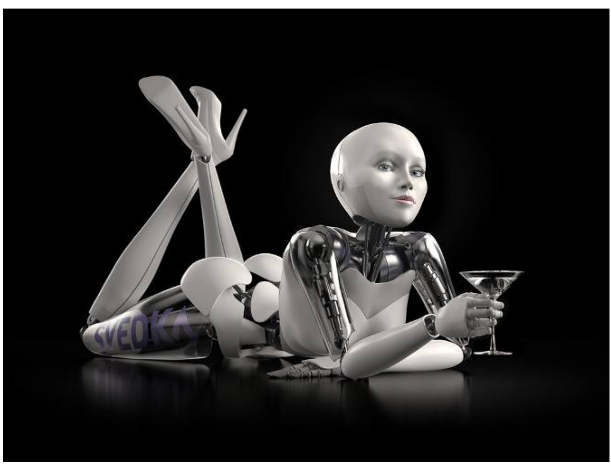
Advertising image for Svedka Vodka (2013)