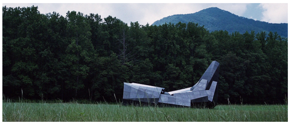
The Cornucopia, The Hunger Games (2012)