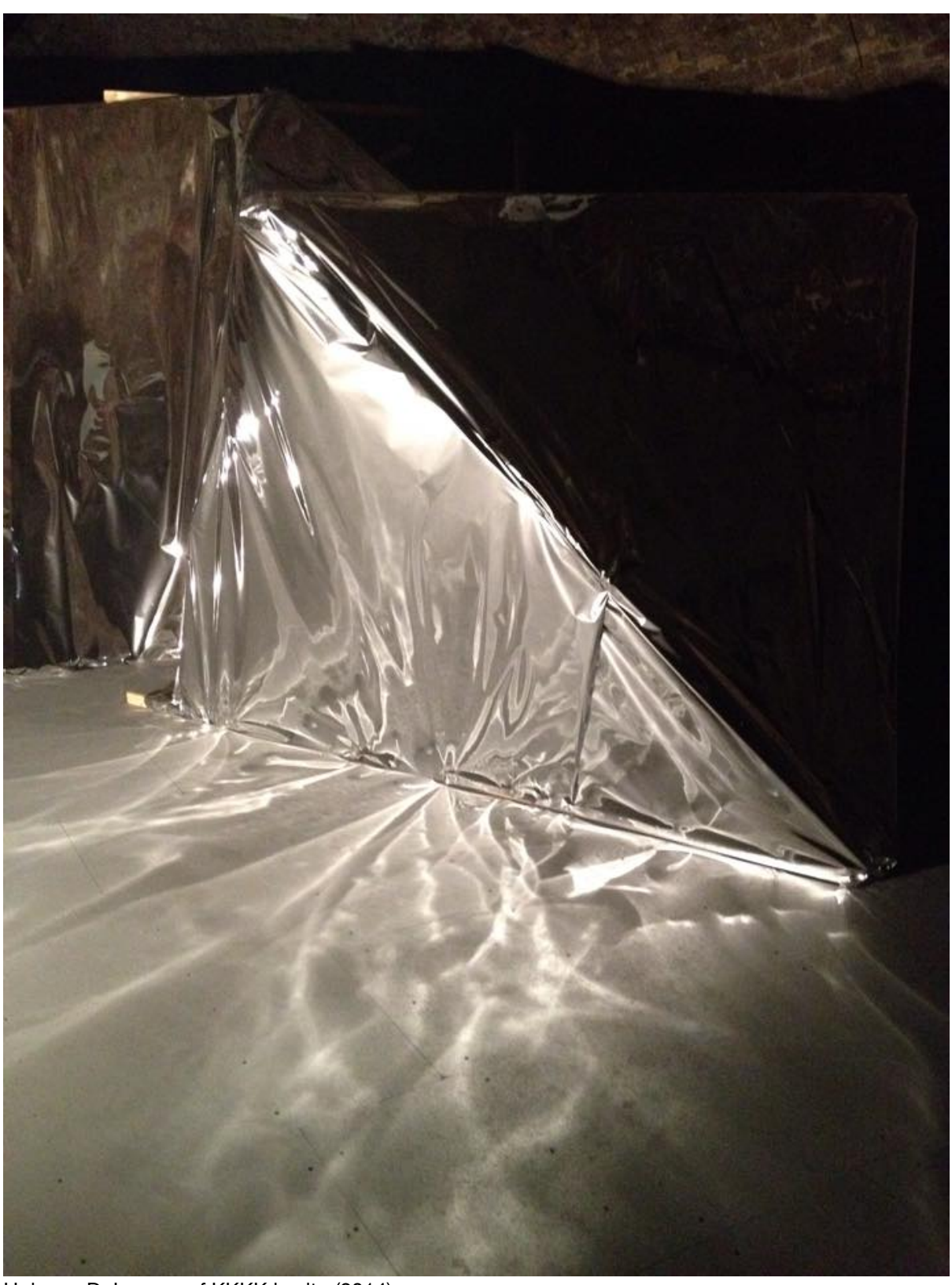
Holmes, D. Images of KKKK in situ (2014).