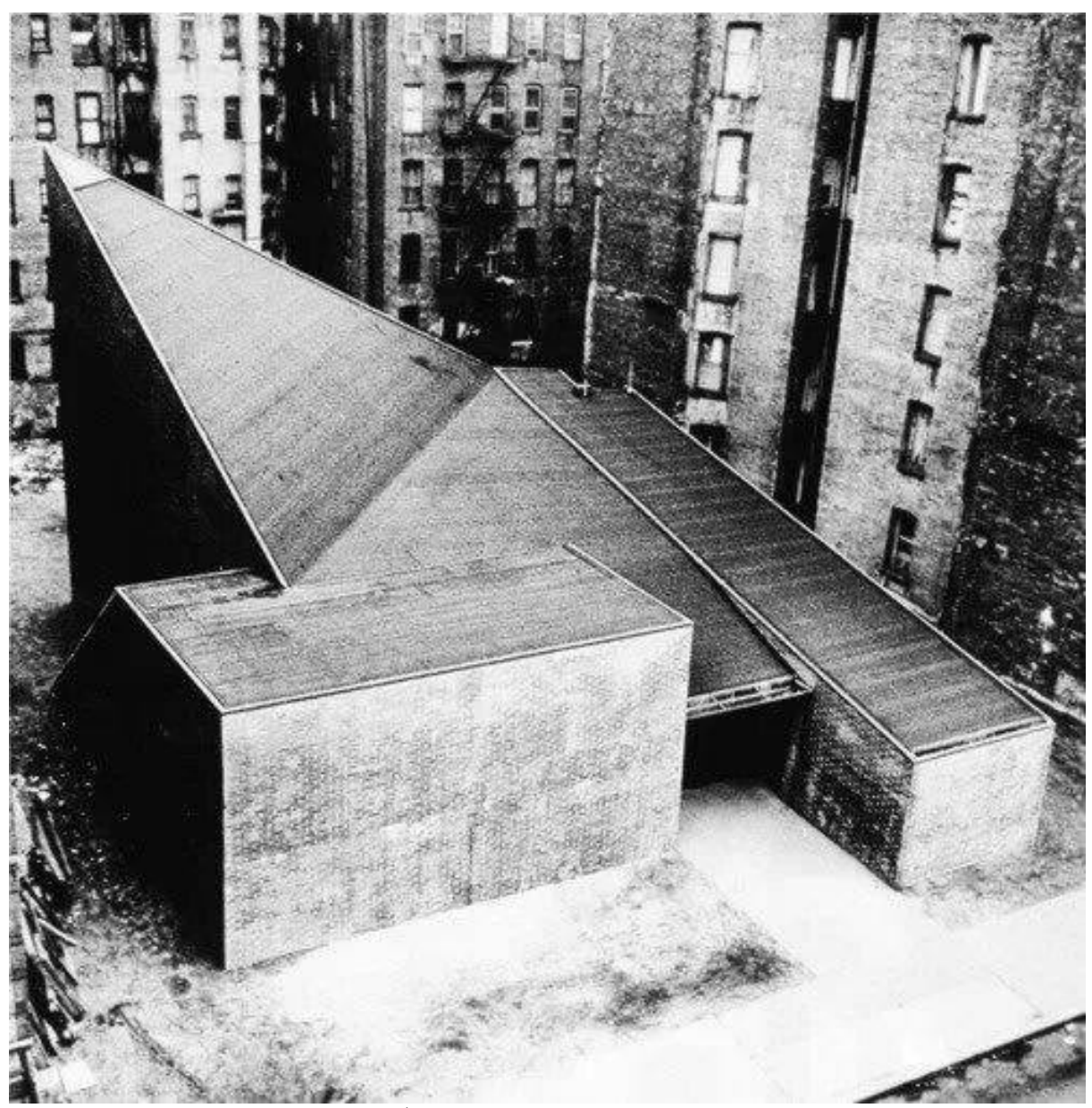
Unknown Architect: Russian early 20th Century