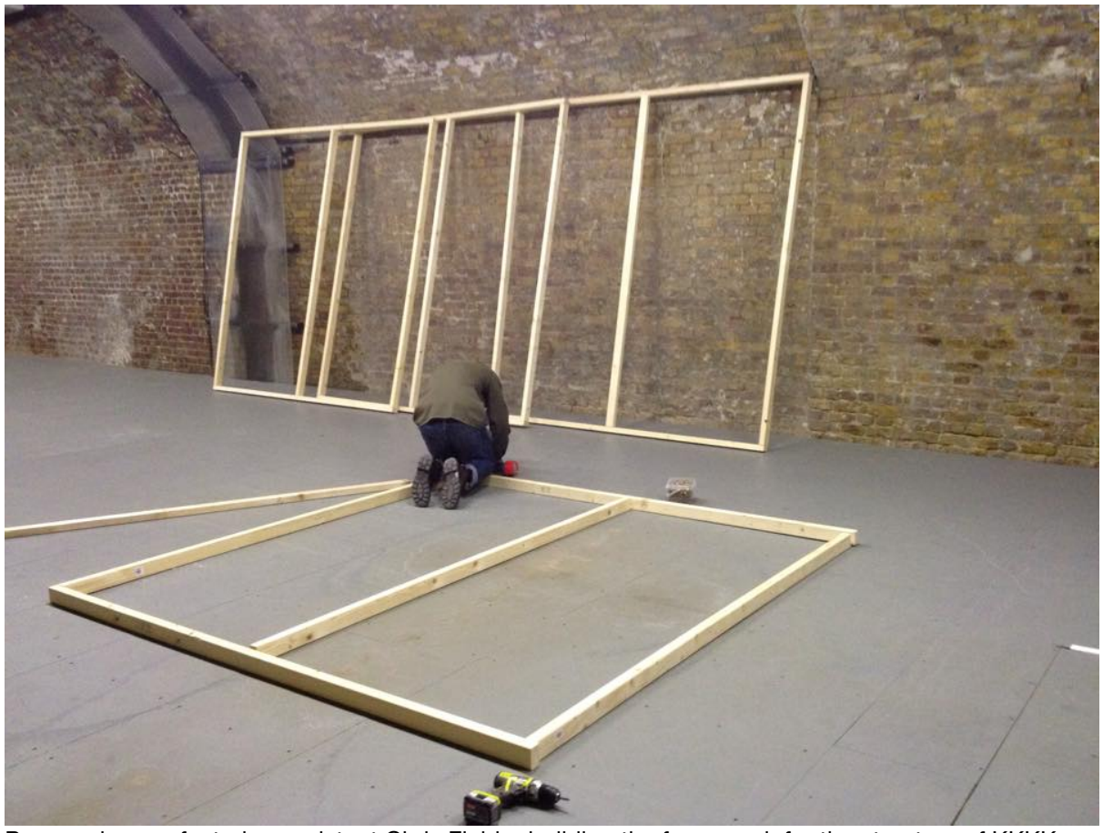
Process image, featuring assistant Chris Fielder building the framework for the structure of KKKK