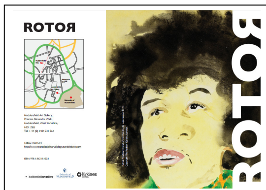
Fig. 3. ROTOЯ part 1 (2012) brochure, cover image: Patrick Procktor, Jimi Hendrix III (detail), 1973. Source: Estate of the Artist and The Redfern Gallery, London.

In 2011 the University of Huddersfield signed a memorandum of understanding (MOU) with Huddersfield Art Gallery, signalling the start of a formal partnership between the two organisations, and instigating an ardent period of collaborative working through a public engagement project entitled "ROTOЯ: transdisciplinary dialogue and debate". ROTOЯ acts as a platform for disseminating and communicating practice-based research through exhibitions, and supporting events and activities, including tours, public talks, reading groups, film screenings, workshops and some outreach activity. The programme showcases a community of artists, designers and curators – all current staff at the University – whose ideas and connective practices migrate and span art and design production. The ROTOЯ programme of exhibitions and events has been a cornerstone of the University of Huddersfield's efforts to introduce new audiences to contemporary art and design, as encouraged by successive Arts Council policies for enhancing public engagement. It also aims to help break down the 'ivory tower' view of universities by taking research outside of the University and into the public realm, making it visible and compelling, and enabling a sense of understanding, community ownership and civic pride in relation to the University and its work.