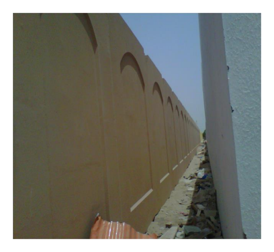
Figure Seven. Space between property boundaries creates unofficial footpaths in Abu Dhabi

Some have also raised concern regarding the extent to which the principles and standards applied in countries such as England can be effectively implemented in countries experiencing high levels of violent crime such as South Africa or Honduras (Kruger, 2015; Cruz, 2015).