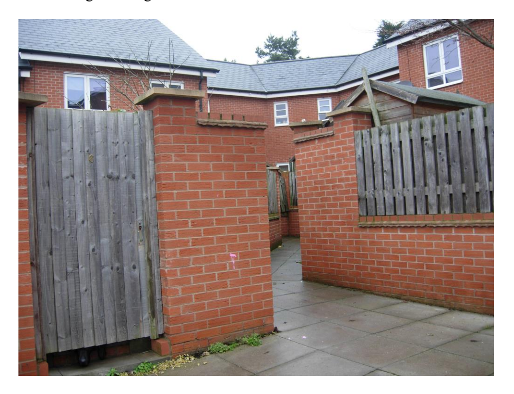
Figure two. Footpaths with bends that obstruct sightlines should be avoided

Where footpaths are required within a development they should not run at the rear of properties (see figure three) and, where possible they should be overlooked by the surrounding dwellings.