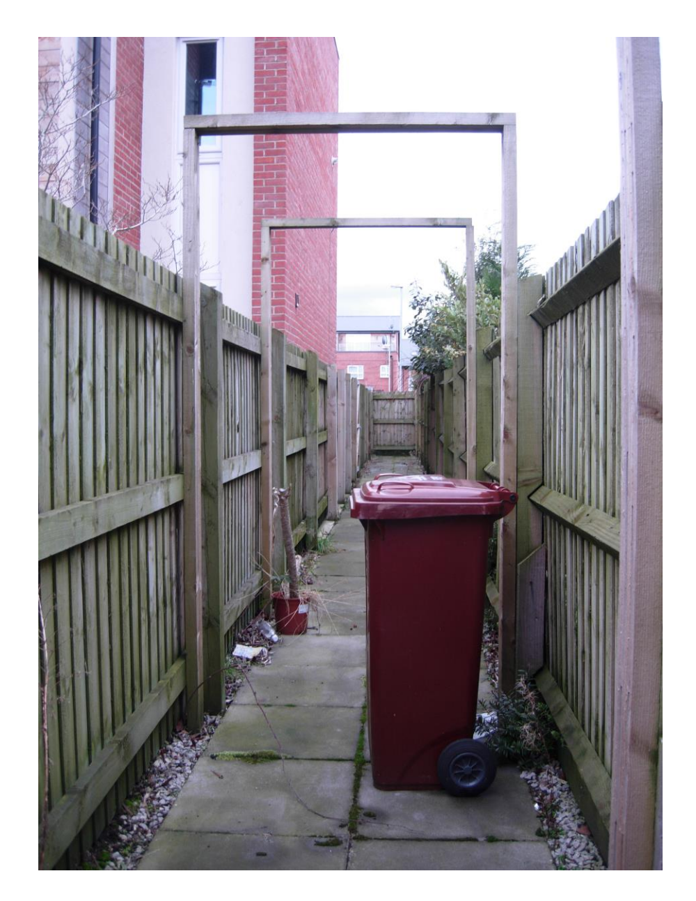
Figure three. Footpaths that run at the rear of properties and are not overlooked by neighbouring properties should be avoided