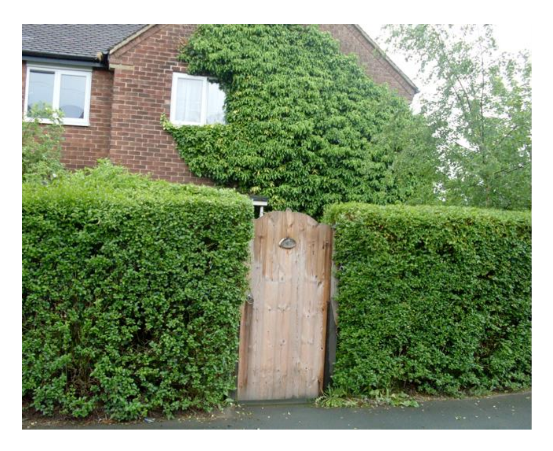
Figure five. This property has poor levels of surveillance

surveillability (Ekblom, 2011) of that space and the creation of the perception amongst offenders that they are being observed.