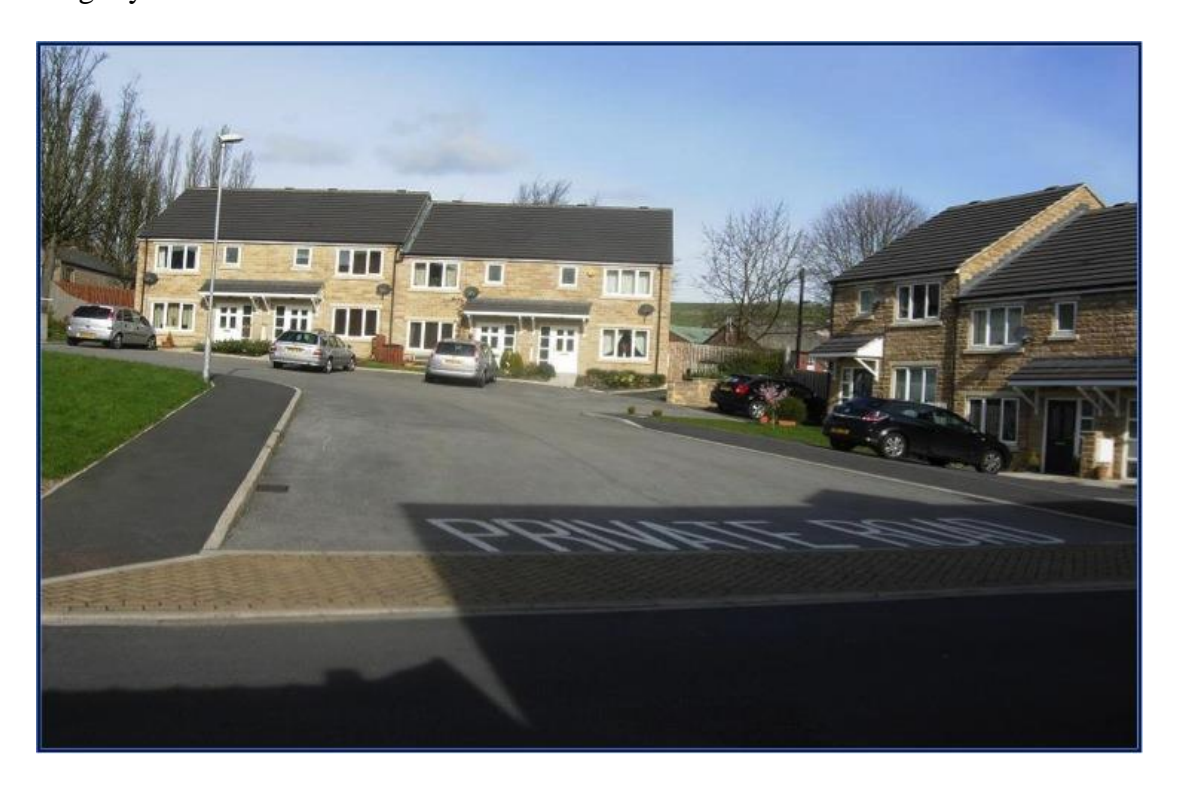
Figure one. Symbolic barriers

burgled houses, properties that had experienced a burglary had fewer symbolic (as well as actual) barriers. In their study of 851 properties in Enschede (The Netherlands), Montoya et al (2014) found that houses with a front garden had a burglary risk 0.46 times lower than those without.