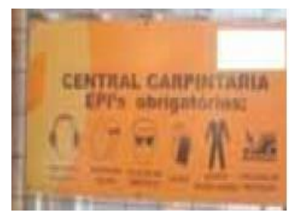
Figure 3: Example of Analysed Case (No. 157) (after Tezel et al., 2010)