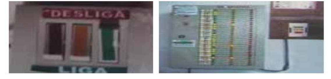
Figure 2: Example of Analysed Case (No. 86) (after Tezel et al., 2010)

Detecting an abnormal of each floor in early stage An abnormal condition Monitoring room Workers On the job Andon with three colours