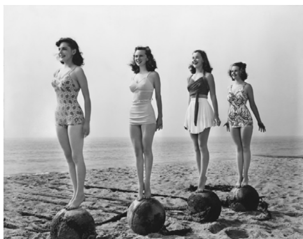
Standing tall allows the vertebrae to unravel and release pressure.

It is also likely to be accompanied by something called the “self-validation theory”. This is when the postures we adopt actually affect how we feel emotionally, so standing tall with shoulders back is a confident posture and subsequently can make us feel and appear more confident. Both theories allow us to communicate how we are feeling to others in our body language, whether this is conscious or subconscious.