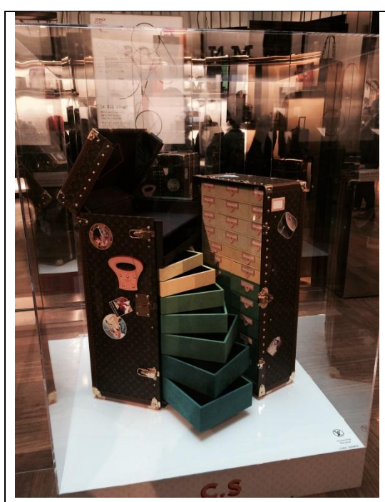
Image 1: Le Fils Rouge, Espace Louis Vuitton, Paris