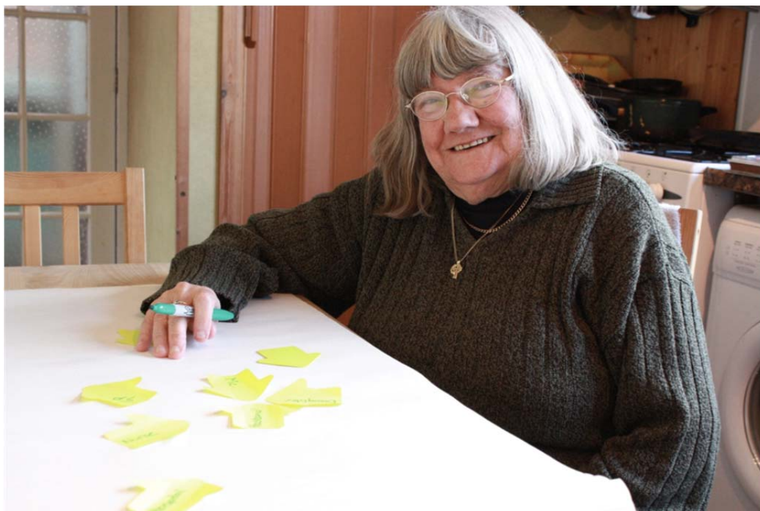
Figure 1. A carer creating a Pictor chart. (picture copyright Beth Hardy).