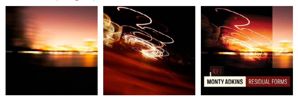
Figure 1. photographic layering (palimpsest) for Residual Forms

This paper explores the theoretical context for audio-visual projects by the authors: Drift Trilogy by Adkins and City Colours by Santamas. The Drift Trilogy (Rift Patterns, Residual Forms and Radial Drift ) is about the psychogeographical exploration of places and how they impact on our identity and emotions. In the Drift Trilogy the artistic intention is to expand the psychogeographical drift from the city, into the wider landscape as well as to our inner world in which multiple instances of experiencing a place converge to form a palimpsest of that place. This intention is also expressed through the photography accompanying the work by Stephen Harvey, particularly the overlaying of images that occurs in the images for Residual Forms (see Figure 1).