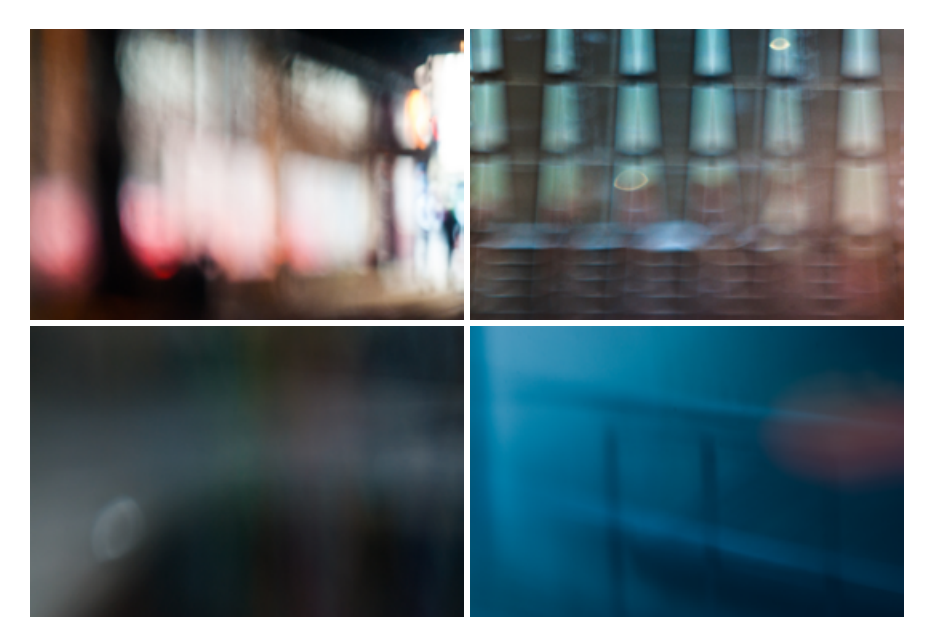
Figure 4. Hali Santamas' images for City

In Santamas' audio-photographic installation City Colours , the audiovisual material is a mixture of captured reality (photographs, field recordings) and synthesised elements, layered to create an abstracted piece of work that takes advantage of a range of sound and image processes on their own terms.