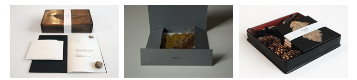
Figure 2. ephemera in Skelton's hand-crafted releases

working on the tracks that signify a 'local' personal sense of place rather than the predominant trend towards globalisation. (see Figure 2).