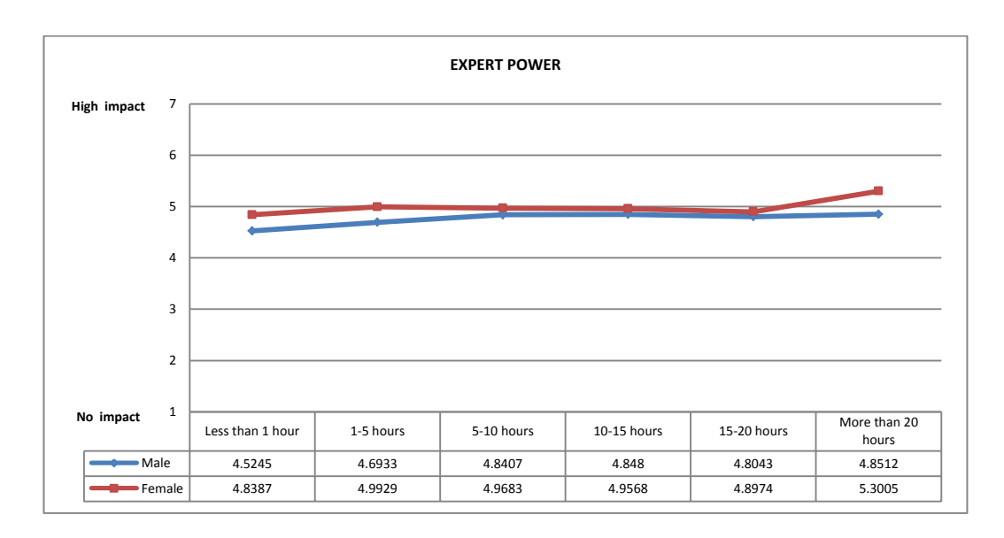
Figure 2: Level of impact of websites on student-lecturer expert power

As shown in figure 1, the use of web pages for the purpose of study is very low among students in both genders More than 60% of students use websites only for 1-5 hours or less per month. However, this amount of use has impacted on their association with their lecturers in terms of their perception of the lecturer as a knowledgeable person. Nevertheless, the results show a noticeable impact on student-lecturer relationship due to the students' access to online knowledge resources. There is only a small difference between male and female results of the impact. Mostly, the level of impact among females is slightly higher compared to that of males.