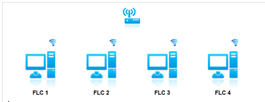
Figure 1: The Architecture of Wireless Fuzzy Logic Controllers