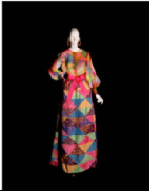
Haute Couture Collection spring-summer 1969 © Alexandre Guirkinger