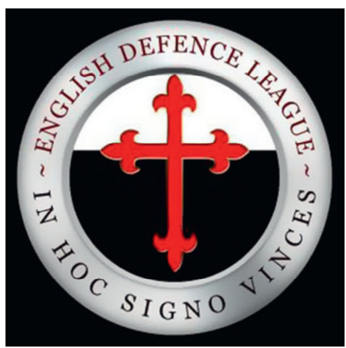
Figure 1. EDL emblem and motto.

informal promotional materials that circulate among activists and their supporters (see Figures 2 & 3).