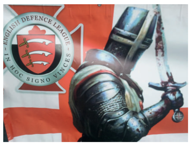
Figure 3. EDL Essex Division banner. Photograph taken by the author 5 / 5 / 2012.

The EDL website and speeches by the EDL leadership provide particularly rich examples of the way that the group has sought to annex both symbols of the nation and various symbols of "Western culture". Here, for example one often finds claims about how (militant) Islam threatens "Western values" such as gender equality, human rights, democracy or sexual freedoms – a civilizational discourse - combined with references to how these "Western values" that are enjoyed in England/Britain were achieved through the "sacrifices of our forefathers who gave their lives fighting against Nazi Germany" – an intensely national discourse.