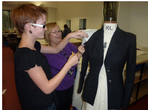
Fig 3 and 4 Tailoring class at University of Huddersfield

A small number of educational establishments in the UK, have responded to this need by reinstating a thorough understanding of the heritage of technical skills within their curricula, or have developed courses and specific modules to capitalise on traditional industries. The BA (Hons) Fashion Design Courses at University of Huddersfield, include a compulsory tailoring module in their year two programmes of study. Each student is required to cut and make a tailored jacket for a size twelve figure. Whilst not a made to measure garment, it is