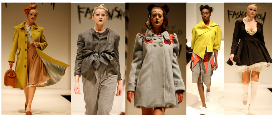
Figs 10, 11, 12, 13 and 14, Examples of tailoring incorporated into final year collections, these include both structured and soft tailoring

are given different design themes to consider. In 2009 the theme was Yves Saint Laurent's classic 'Le Smoking' look. In 2010 the tailoring project had a silver disco theme. By their final year, students develop individual collections and their knowledge of tailoring is cemented in the successful realisation of tailored garments within their coordinated looks. With this knowledge students are able to distinguish between softly tailored and more structured looks. They are also encouraged to consider other designer's tailored work when developing skills. By studying a designer and developing an in-depth empathy for their individual work methods and technique, it provides a platform for students to develop their own particular knowledge. Emphasis is placed on designers such as Dior, who revolutionised structured tailoring in his New Look collection in 1947, by introducing hip and breast padding in order to enhance silhouette. Chanel is also emphasised as a designer who innovated soft tailoring, by removing structural underpinning, in order to create softer, more fluid lines.