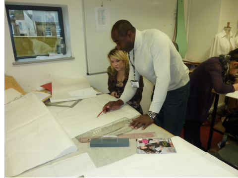
Fig 1 and 2 Tailoring class at University of Huddersfield