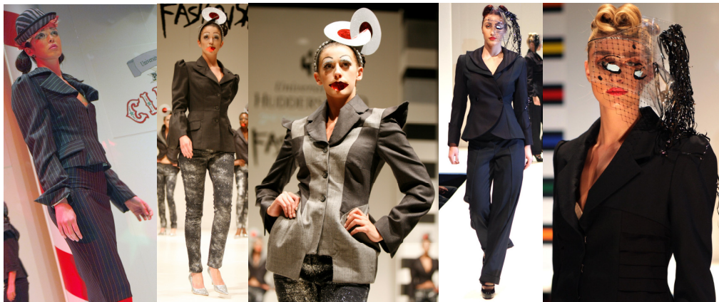
Figs 5, 6, 7, 8 and 9, Examples from the second year tailoring module at University of Huddersfield.

produced to manual bespoke standards. A specialist tailoring tutor and technician guide students in the techniques of tailoring. This understanding underpins the student's perception of pattern cutting, fit, sizing, proportion and their overall approach to making clothes. It also helps them to fully understand and distinguish between the qualities of different types of garments. For instance, the technical approach in making a shirt or a draped jersey dress is considerably different to the approach adopted when making a tailored garment.