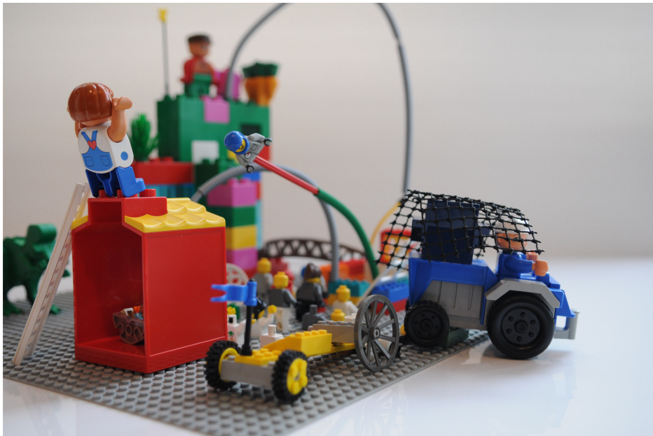
Figure 1: Model depicting limited space and unsuitable vehicles

Analysis of the model's architecture exposed reoccurring metaphorical themes. The repetition of imagery such as obstacles courses, a Berlin wall and barriers all inhibited their professional performance. Models frequently depicted heavily loaded people and vehicles. Vehicle models in particular were built haphazardly inferring inconsistency, improvisation and inappropriateness of design rather than a coherently designed service (Figure 1). The use of visual recording equipment enabled a participant's oral descriptions of their models to be captured with 100% accuracy.