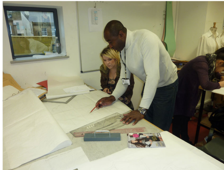
Tailoring class at University of Huddersfield