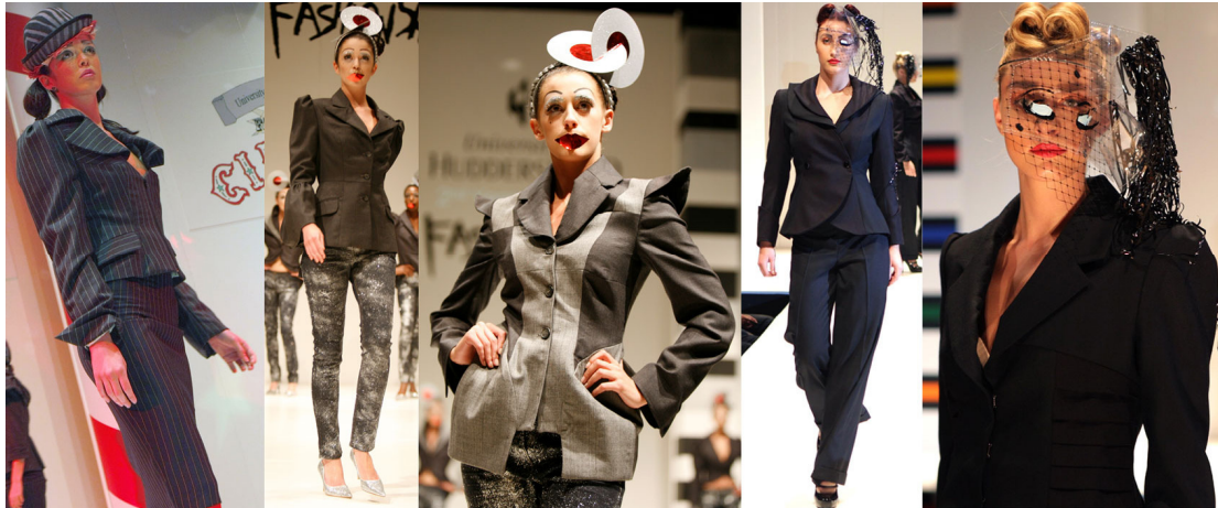
Examples from the second year tailoring module at University of Huddersfield.

guide students through techniques. This understanding underpins the student's perception of pattern cutting, fit, sizing, proportion and their overall approach to making clothes. It also helps them to fully understand and distinguish between the qualities of different types of garments. For instance, the technical approach in making a shirt or a draped jersey dress is considerably different to the approach adopted when making a tailored garment.